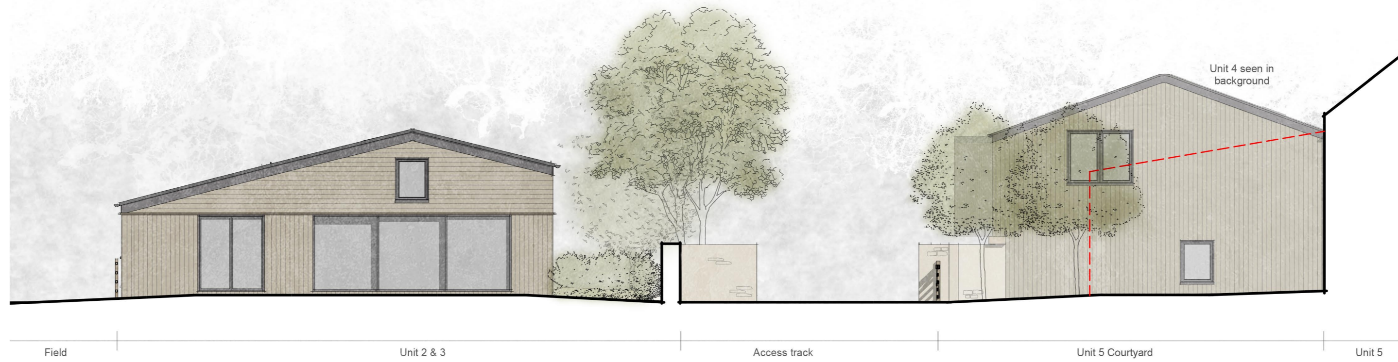
Unit 2 & 3 - West Elevation

Planning This drawing has been prepared for workstages up to planning application purposes only and is not intended "for construction". The 'scale bar' should only be used to check the drawing has been reproduced to the correct size. No responsibility can be accepted for errors made by others in "scaling" from this drawing.