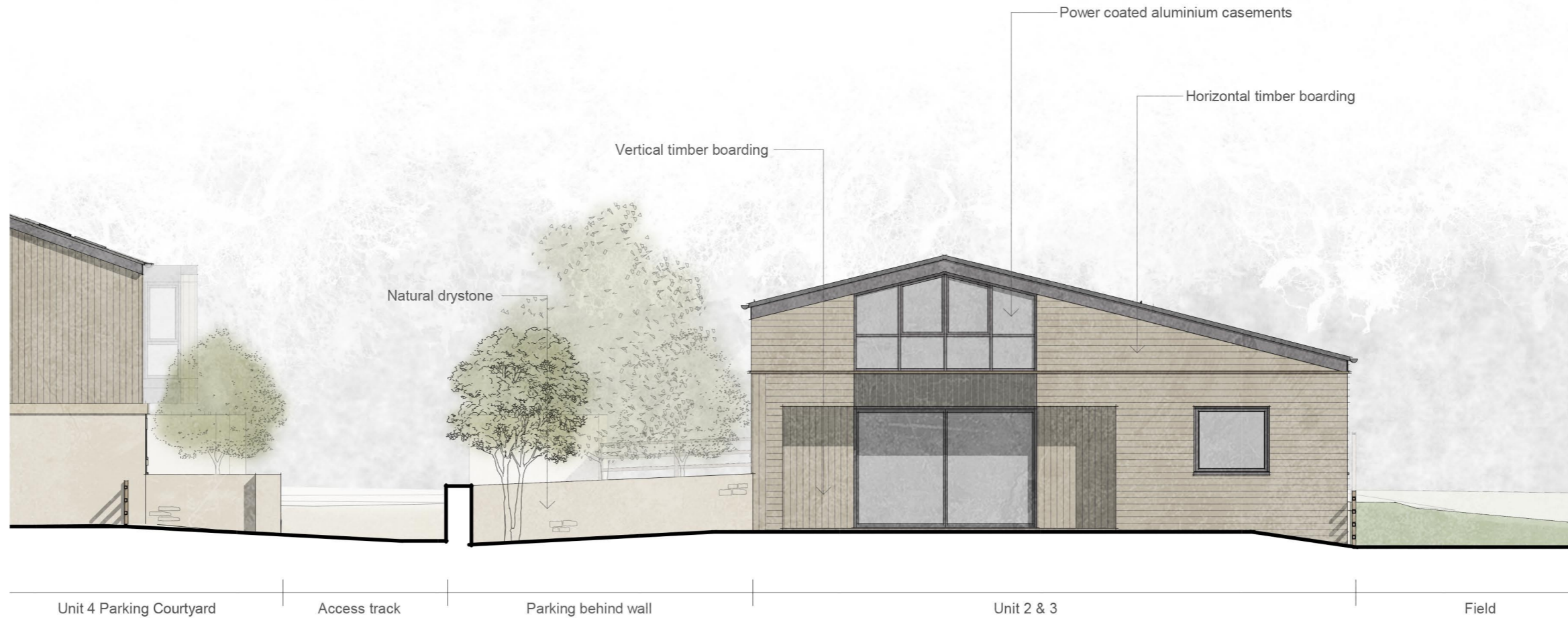
Unit 2 & 3 - East Elevation