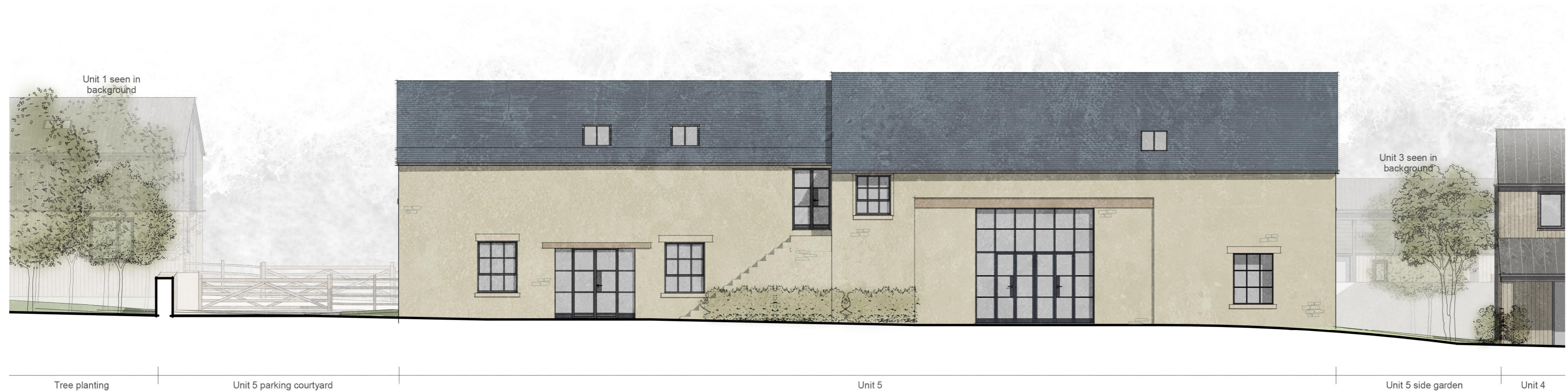
Unit 5 - South Elevation

Planning This drawing has been prepared for workstages up to planning application purposes only and is not intended "for construction". The 'scale bar' should only be used to check the drawing has been reproduced to the correct size. No responsibility can be accepted for errors made by others in "scaling" from this drawing.