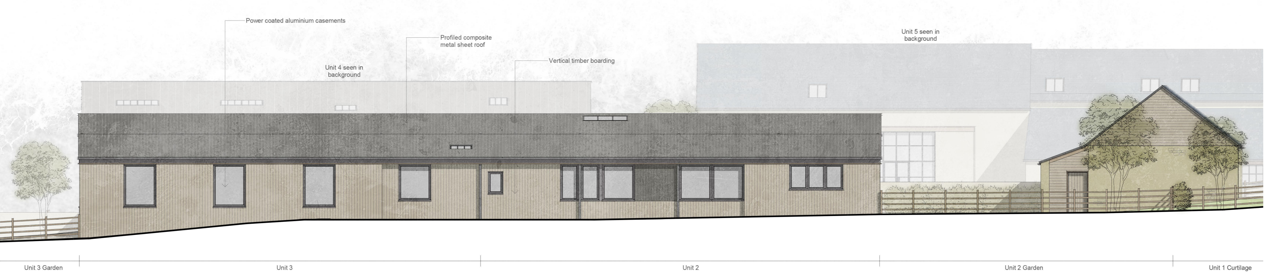
Unit 2 & 3 - North Elevation