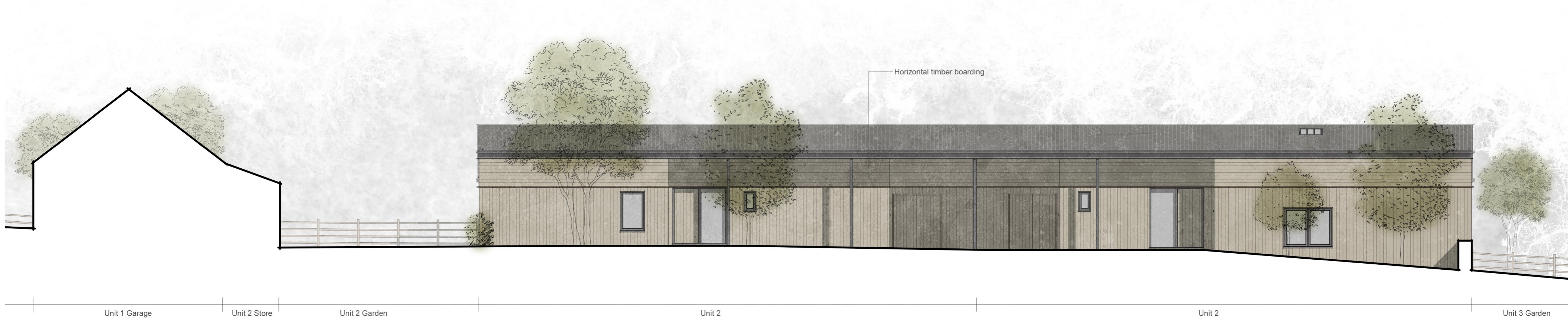
Unit 2 & 3 - South Elevation

Planning This drawing has been prepared for workstages up to planning application purposes only and is not intended "for construction". The 'scale bar' should only be used to check the drawing has been reproduced to the correct size. No responsibility can be accepted for errors made by others in "scaling" from this drawing.