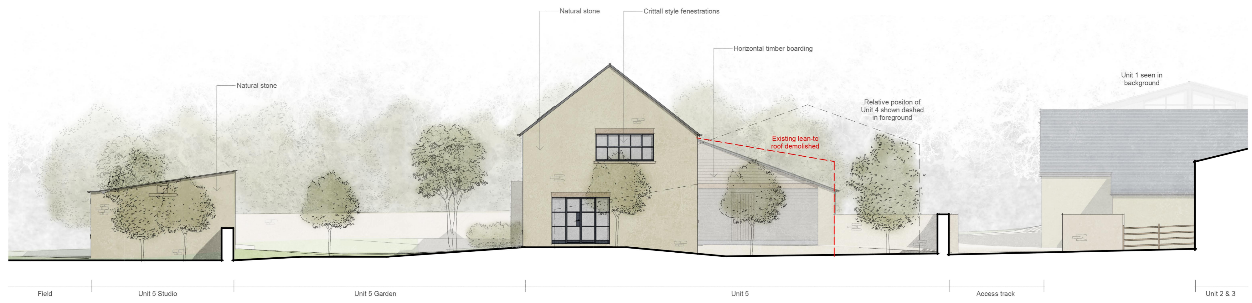
Unit 5 - East Elevation