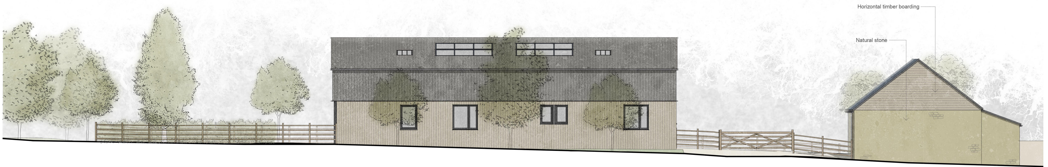
Unit 1 - North Elevation

Planting Unit 1 Garden Unit 1 Unit 1 Parking Courtyard Unit 1 Garage Unit 2 Storage