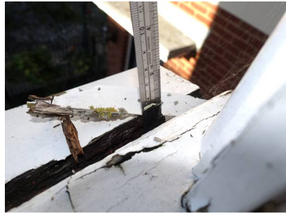
Front First Floor Rotten Sill