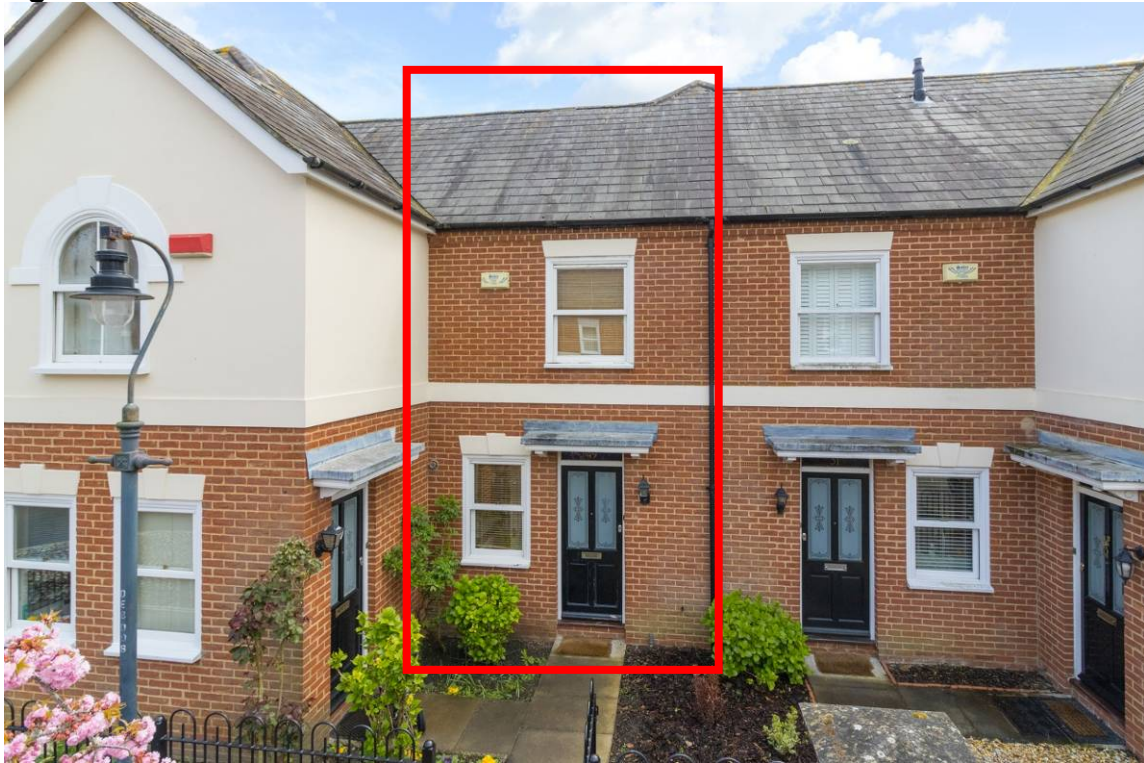
Figure 1. Front Elevation of 49 Orient Place

Note the front elevation of 49 Orient Place is only visible from other properties, of the same age, within Orient Place. This is true of most properties in Orient Place, but especially so with number 49 due to projecting portions of numbers 47 and 53. It is not visible from any listed building.