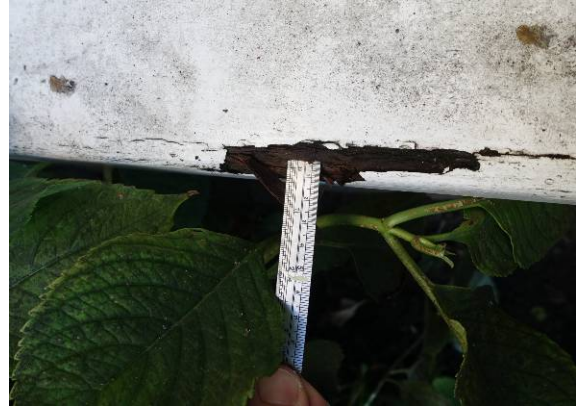
Front Ground Floor Rotten Sill