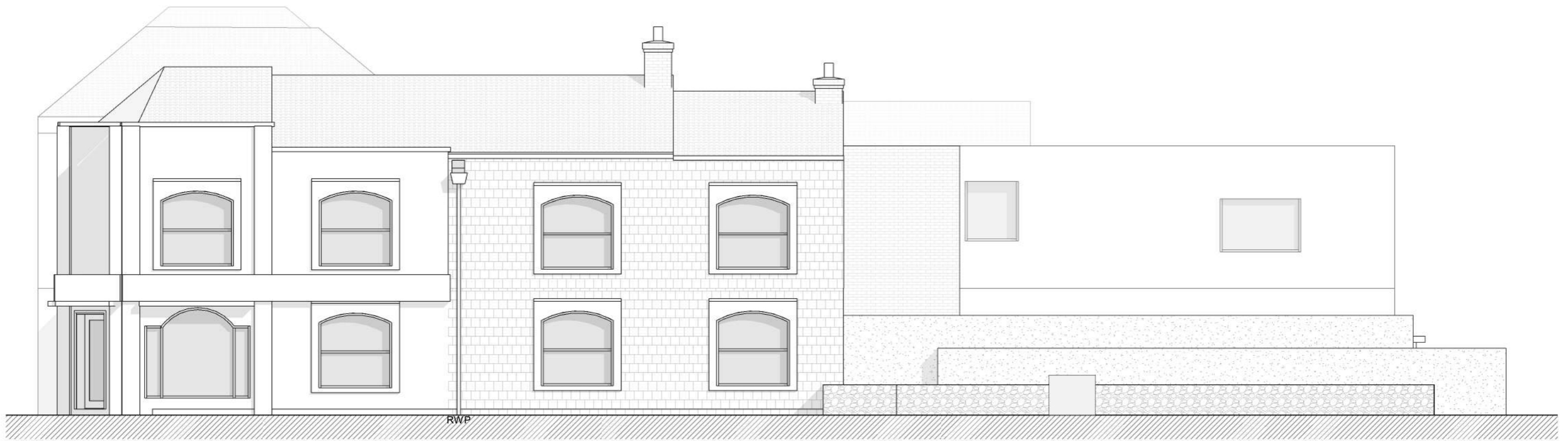
1 EXISTING EAST ELEVATION 012 SCALE 1 : 100