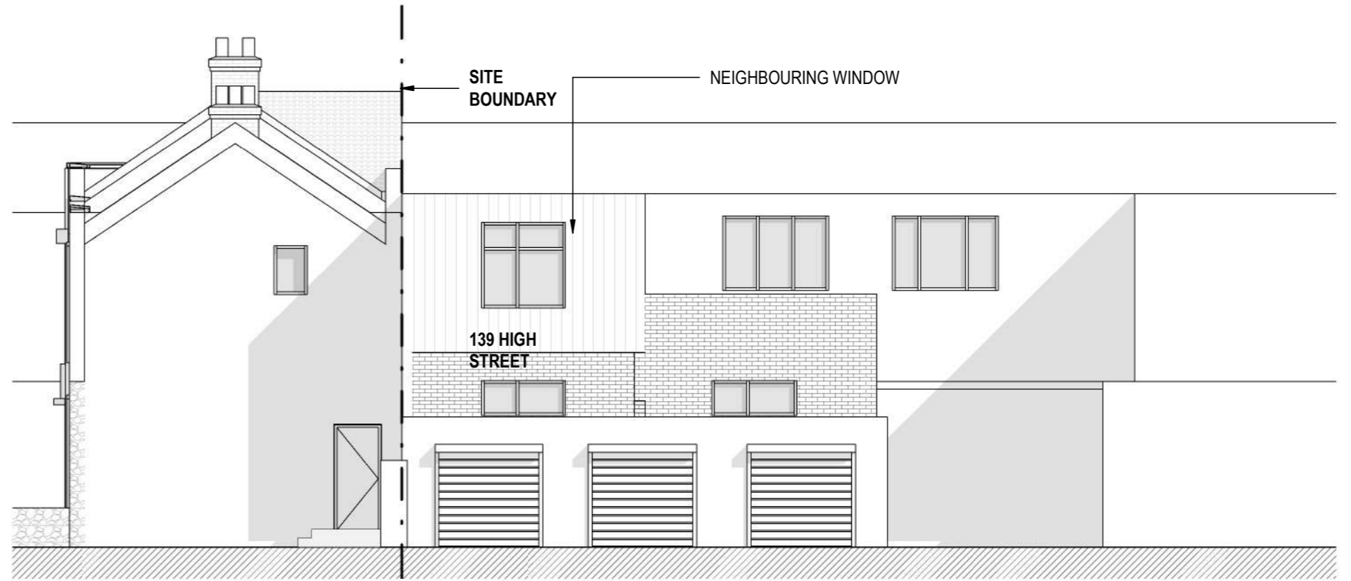
3 EXISTING NORTH ELEVATION 012 SCALE 1 : 100