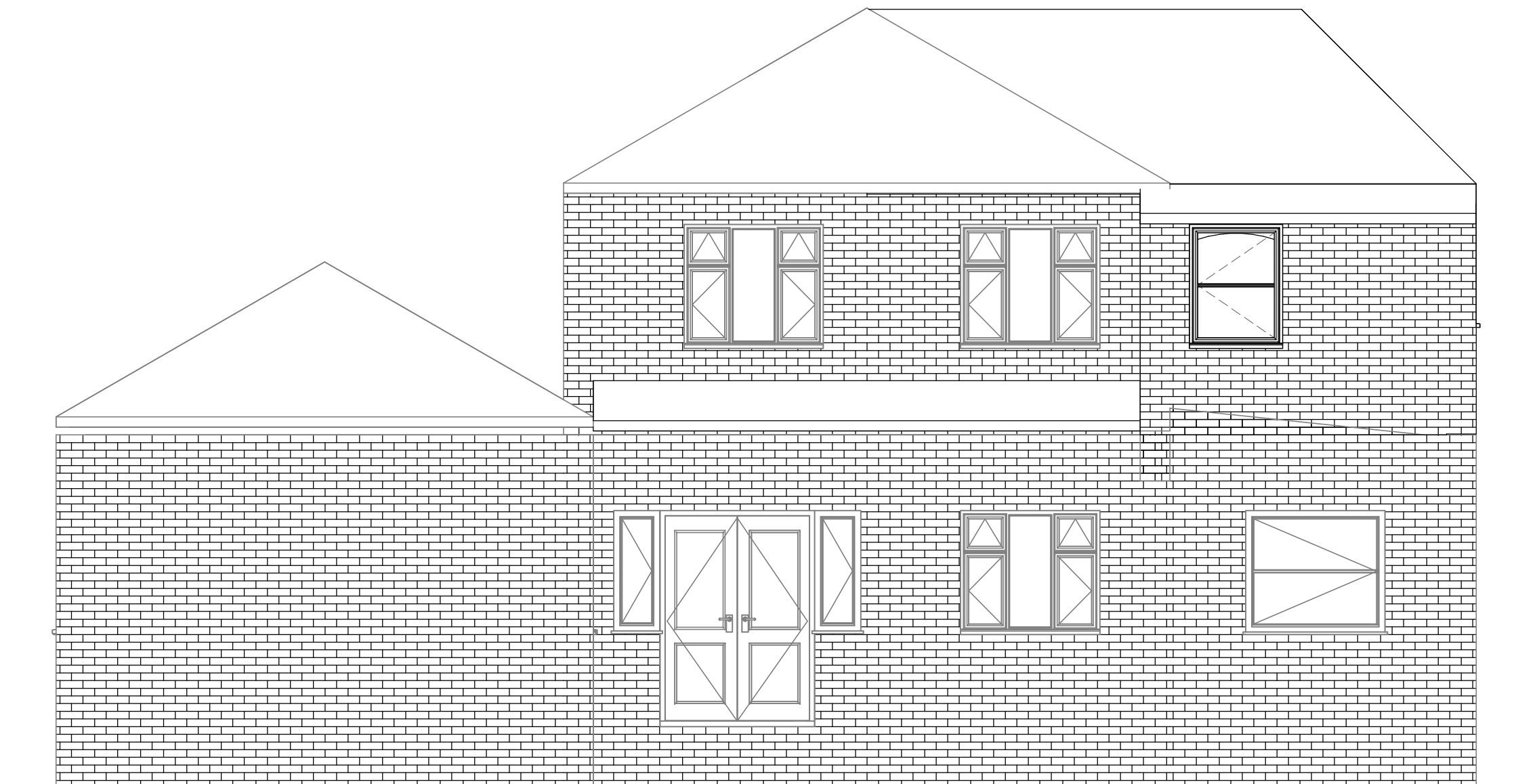
2 PROPOSED SIDE ELEVATION 2 1 : 50