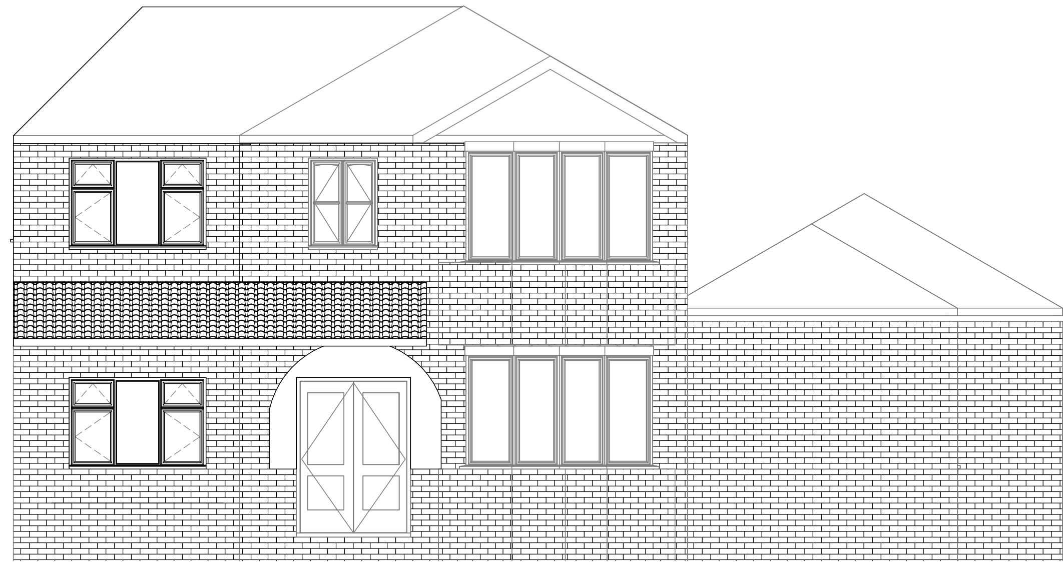
1 PROPOSED FRONT ELEVATION 1 : 50