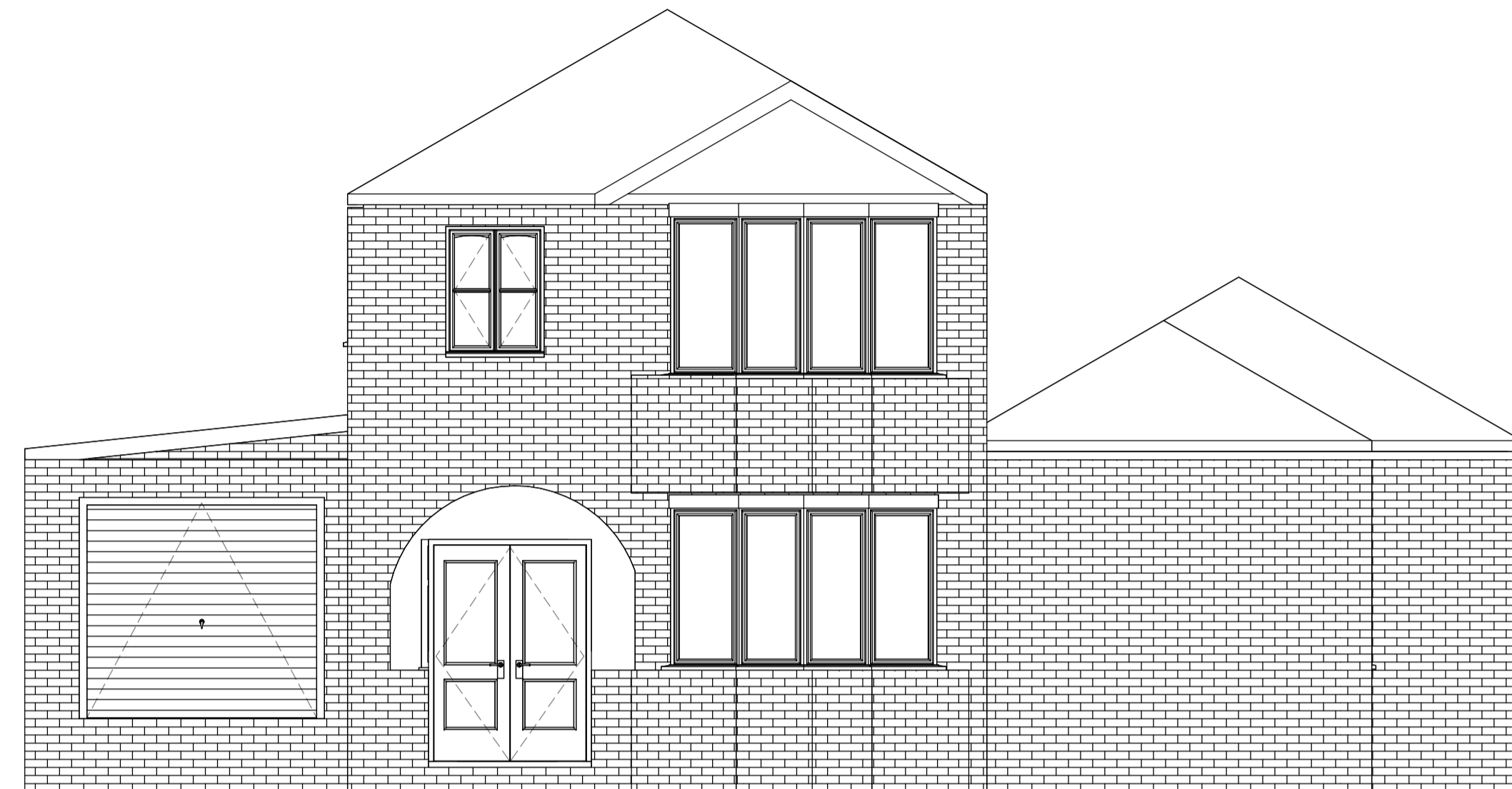
2 EXISTING FRONT ELEVATION. 1 : 50