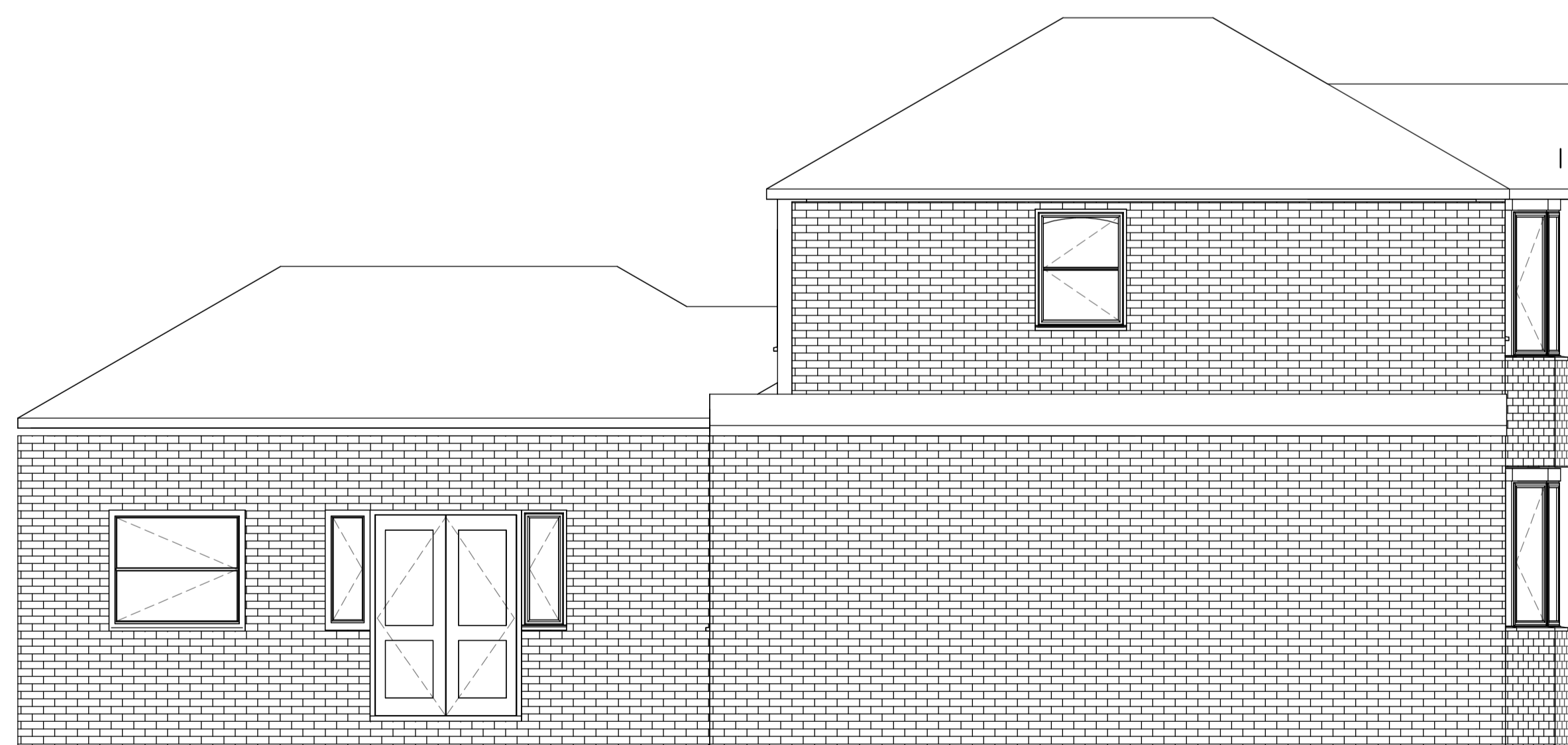
3 EXISTING SIDE ELEVATION 1 : 50