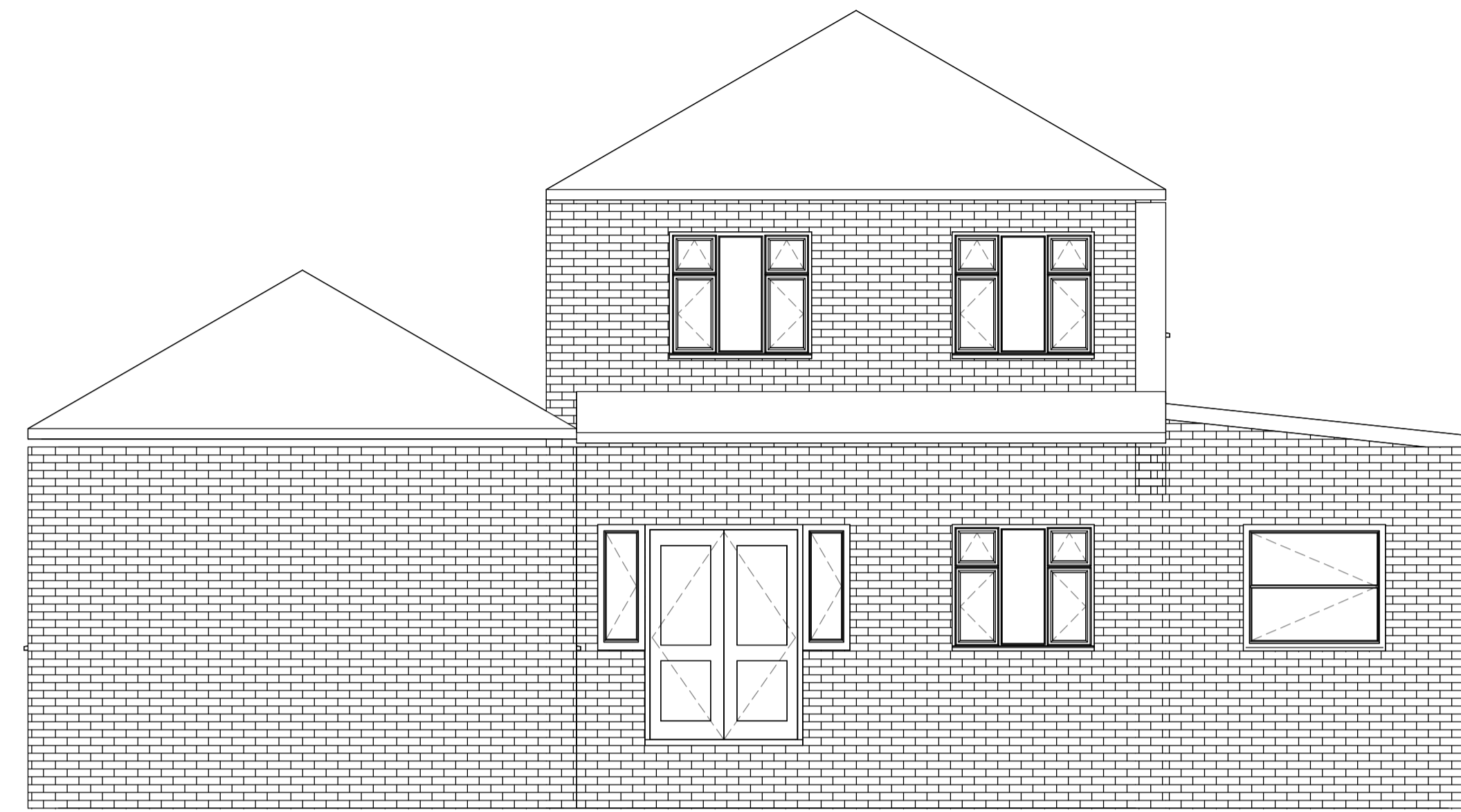
1 EXISTING REAR ELEVATION. 1 : 50