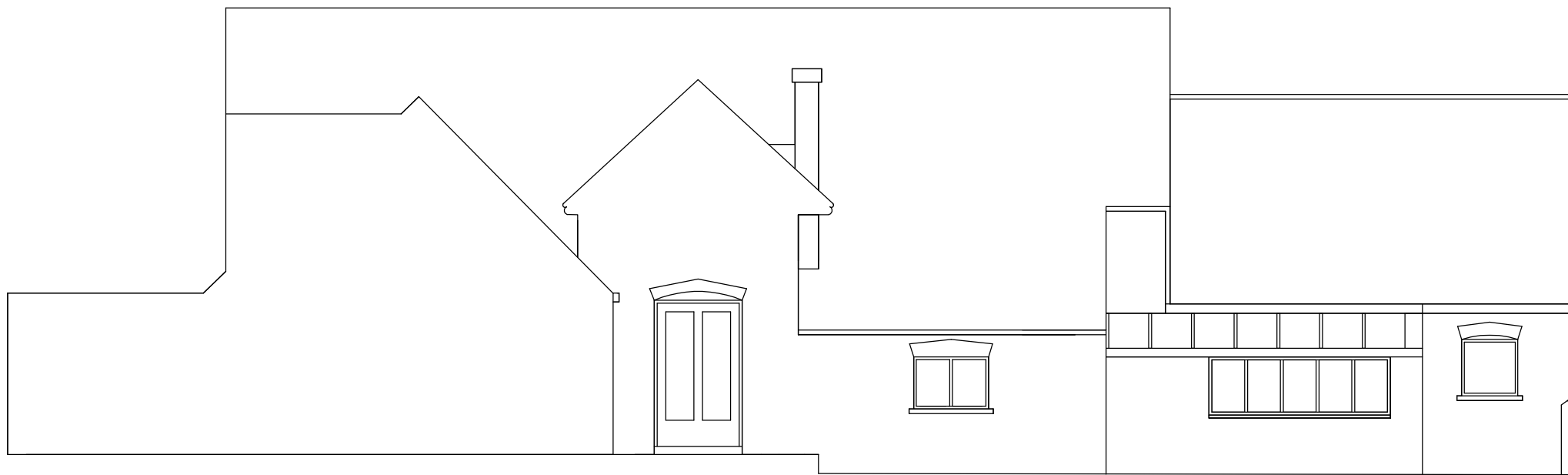
EXISTING FRONT & REAR ELEVATIONS Scale 1:100