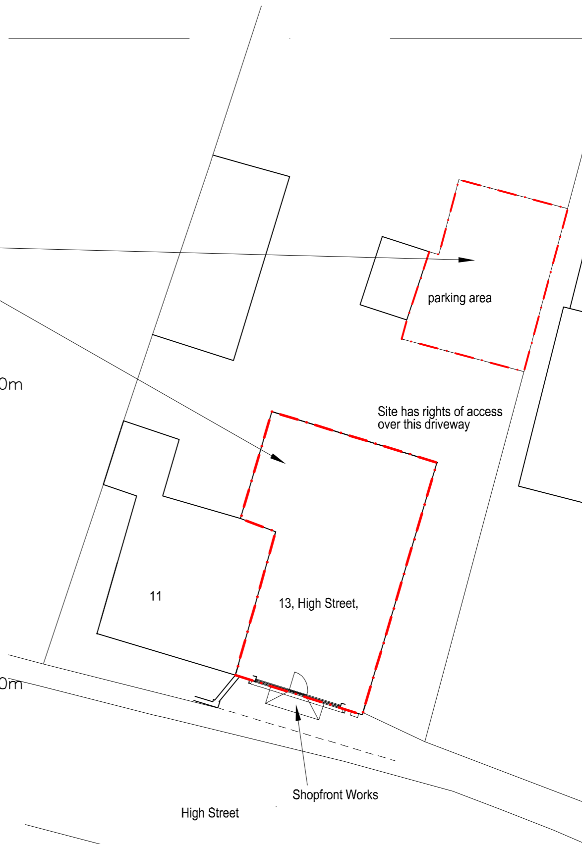
Block Plan 1:200

Project Shopfront Remedial Works, 13 High Street, Branston, Lincoln LN4 1NB John Haynes Drawing Site Location and Block Plan Client Mr J. Mohammed Drawing No 909-A3-001 Date November 2023 Scale 1:200 @A3 39, Hawthorn Road, Lincoln, LN4 4QX Tel. 01522 521272 Mobile 07836 662089 E-mail john_haynes@talktalk.net Web www.john-haynes-design.co.uk