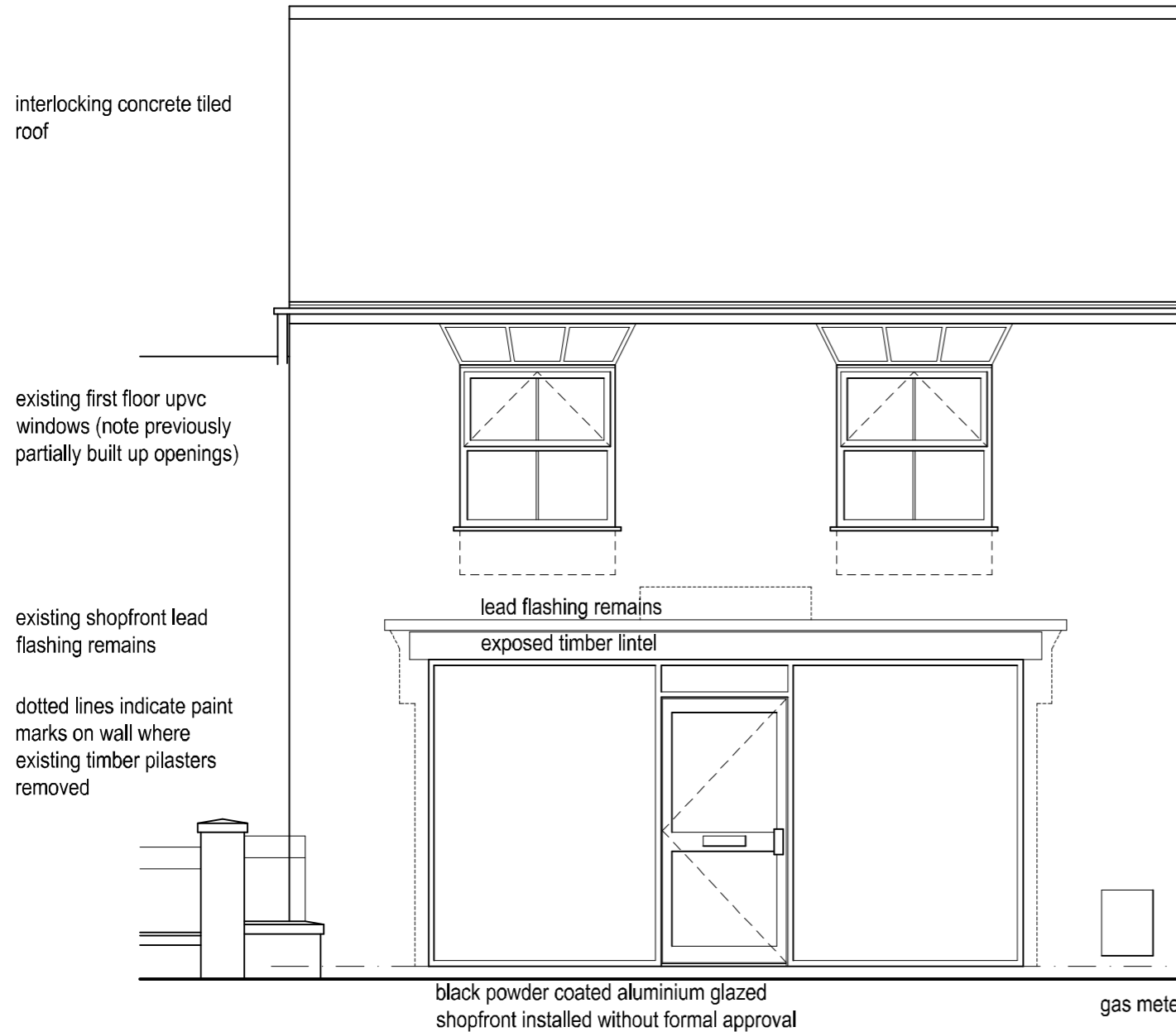
Elevation to High Street as Existing 1:50