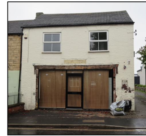
Current Status Photograph taken 26th October 2023