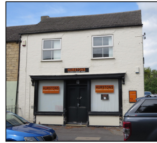
Original Status Photograph taken early July 2023