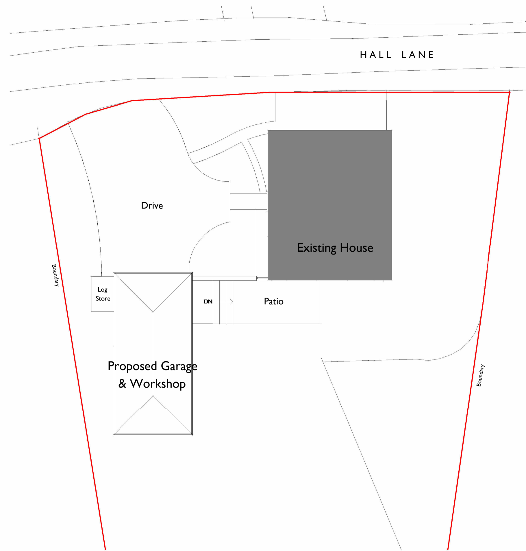
Proposed Site Layout 1 : 200