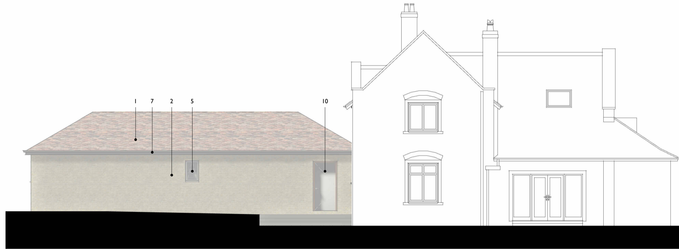
Proposed East Elevation 1 : 100