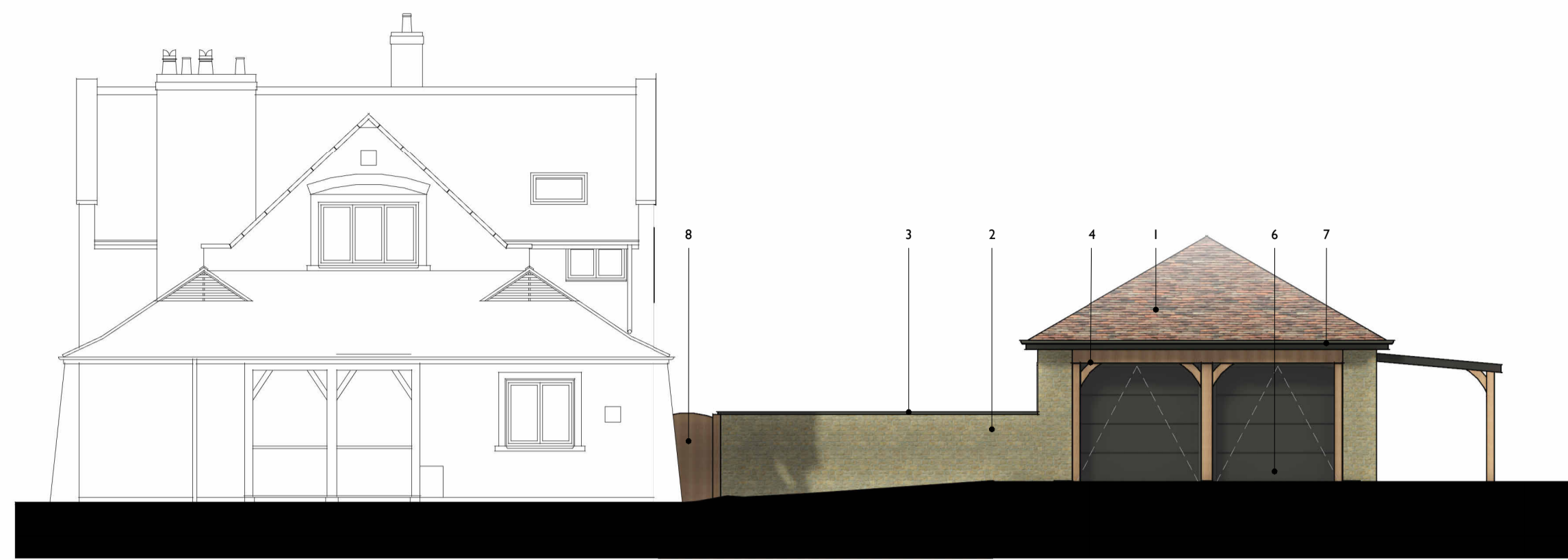
Proposed North Elevation 1 : 100