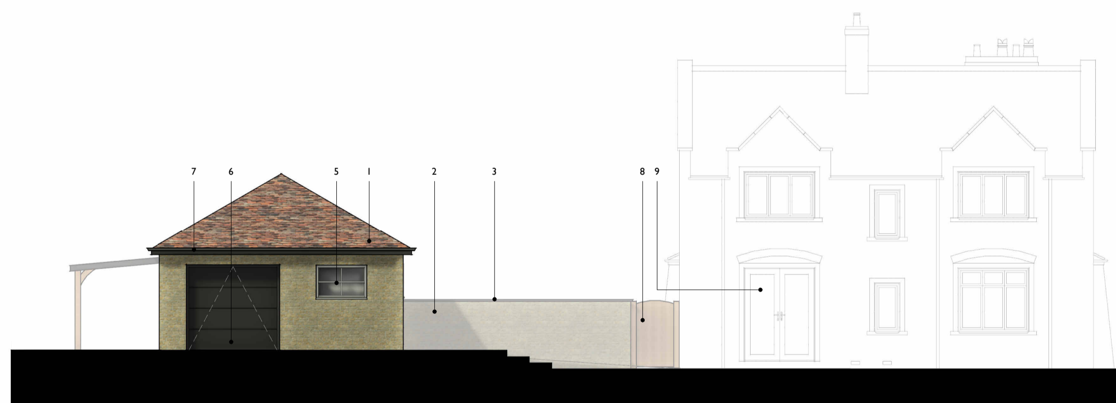
Proposed South Elevation 1 : 100