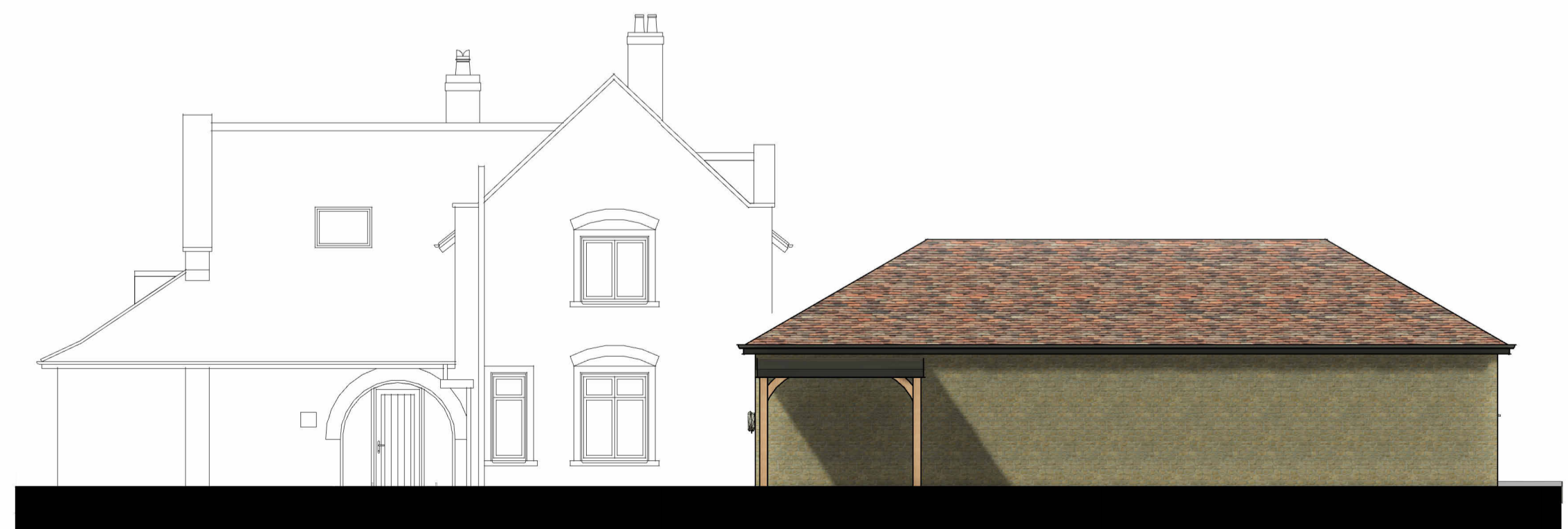
Proposed West Elevation 1 : 100