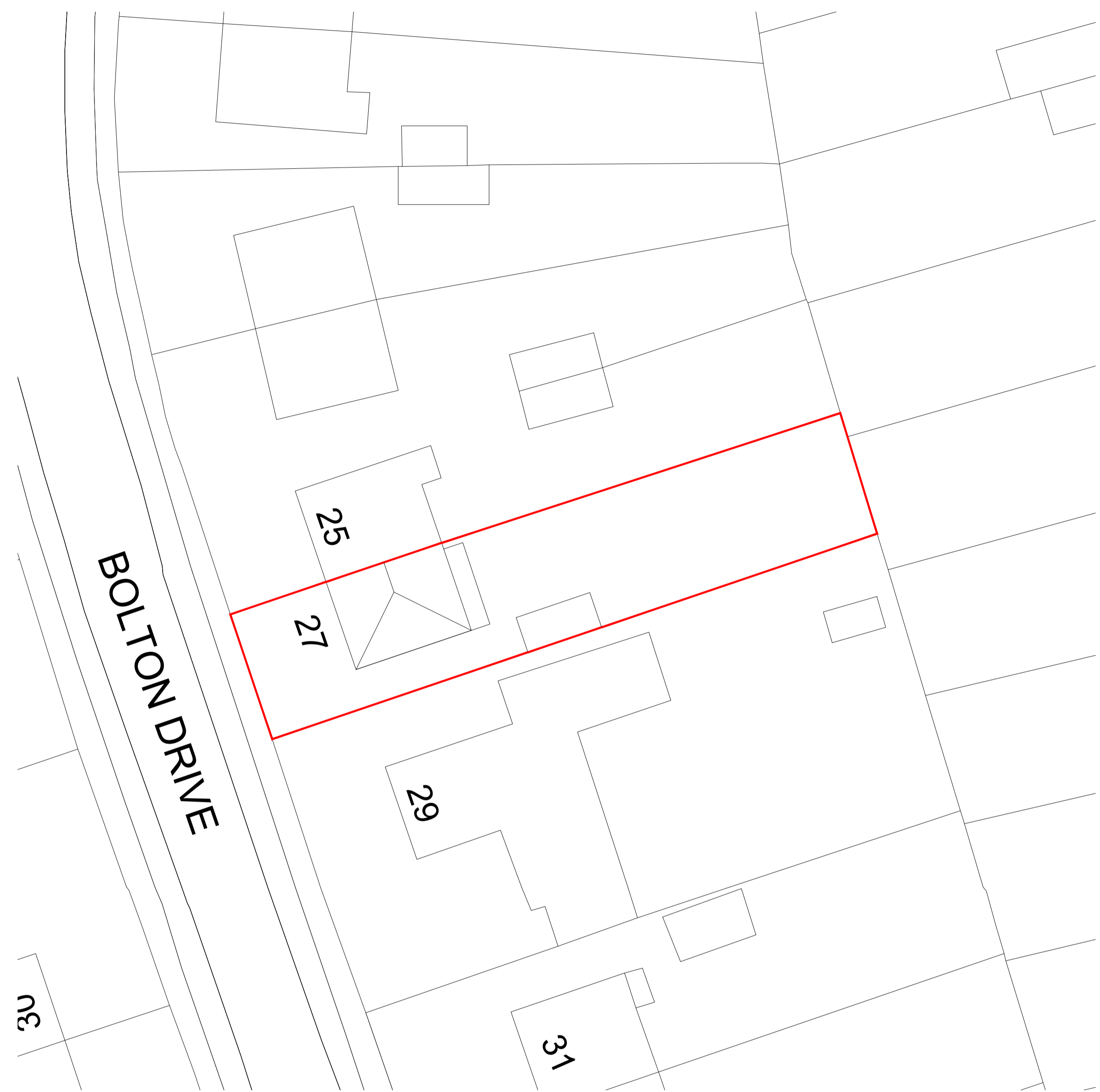
EXISTING SITE PLAN Scale 1:200@A1