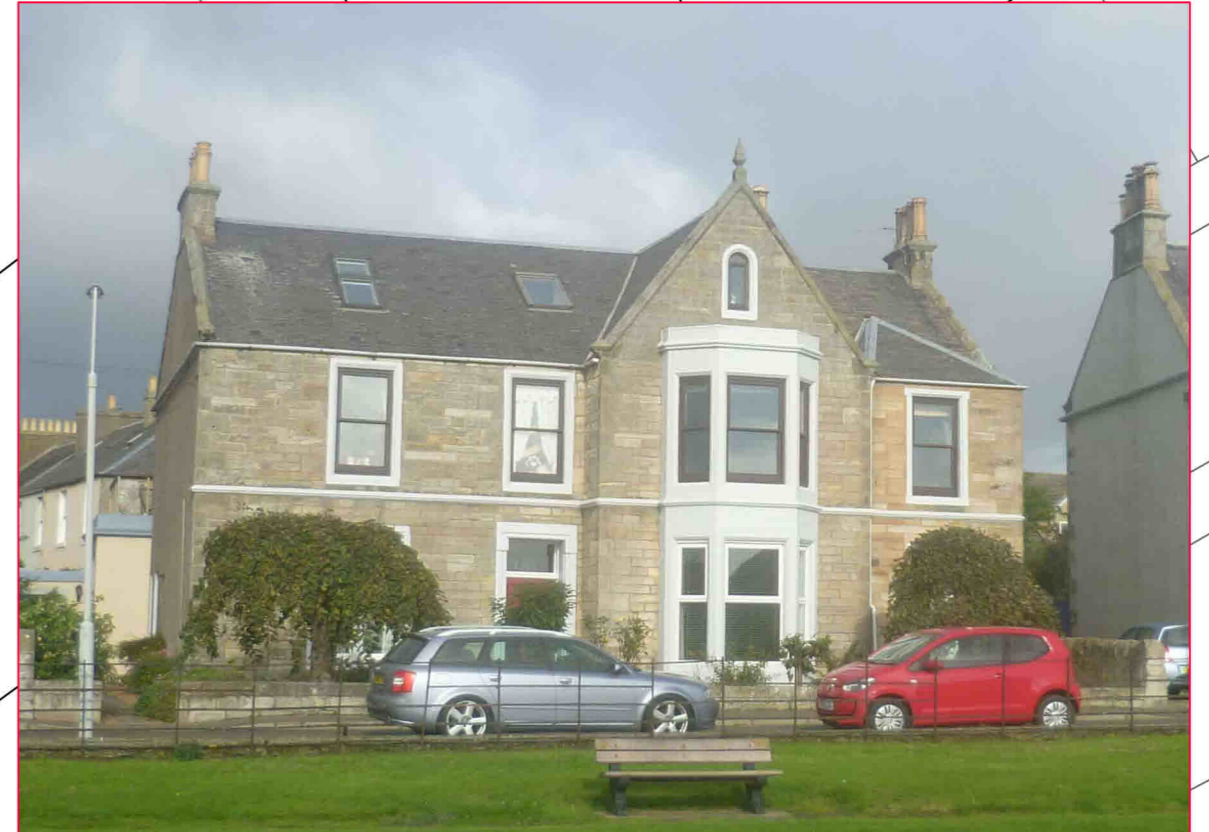
VIEW FROM SOUTH EAST

© Crown copyright and database rights 2023. All rights reserved. Ordnance survey licence number 100023385