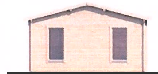
SLANE OUTBUILDING REAR + FAR SIDE GABLE ELEVATIONS 1:100