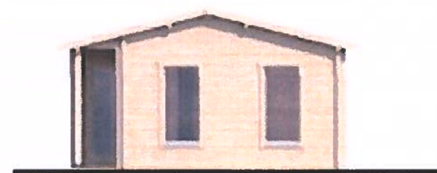
SLANE OUTBUILDING FRONT + ENTRANCE SIDE GABLE ELEVATIONS 1:100