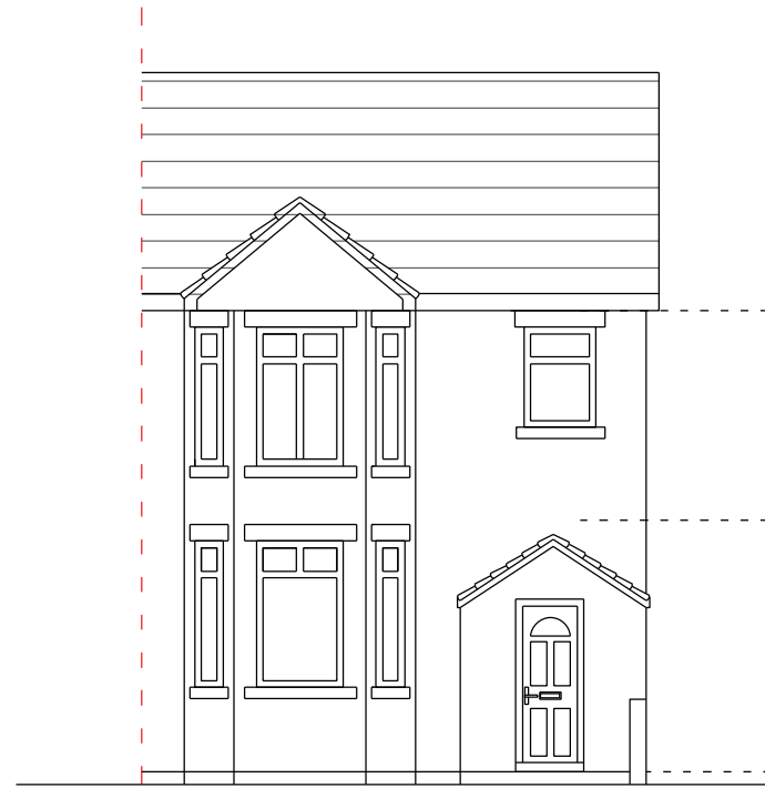
Proposed Front Elevation 1:100

Facing Brick to Match Existing Concrete Roof Tiles to Match Existing Black uPVC Gutter & Downpipes