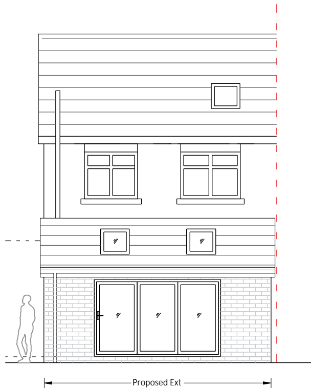
Proposed Rear Elevation 1:100