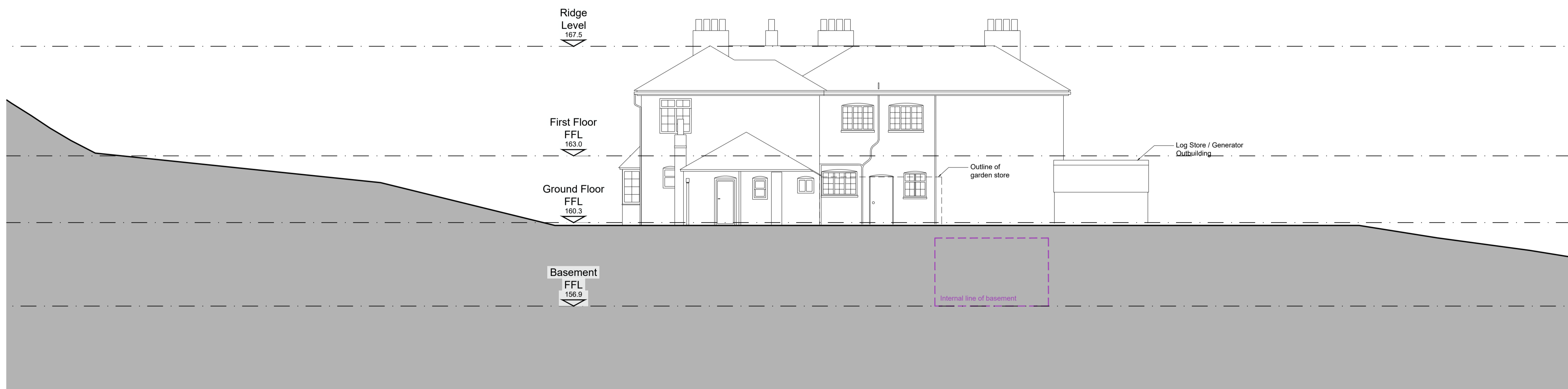
4 ELEVATION Existing North Elevation SCALE 1: 100