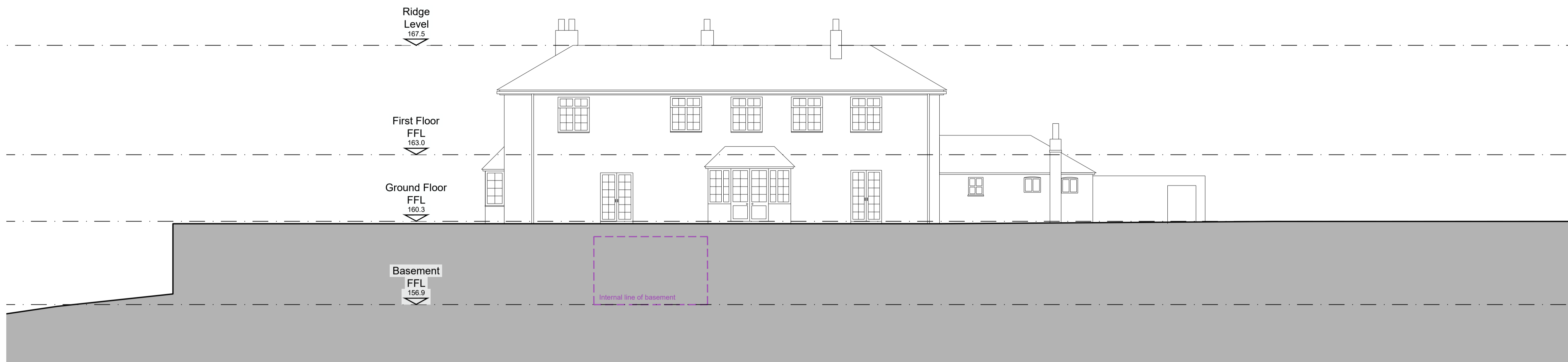
3 ELEVATION Existing East Elevation SCALE 1: 100