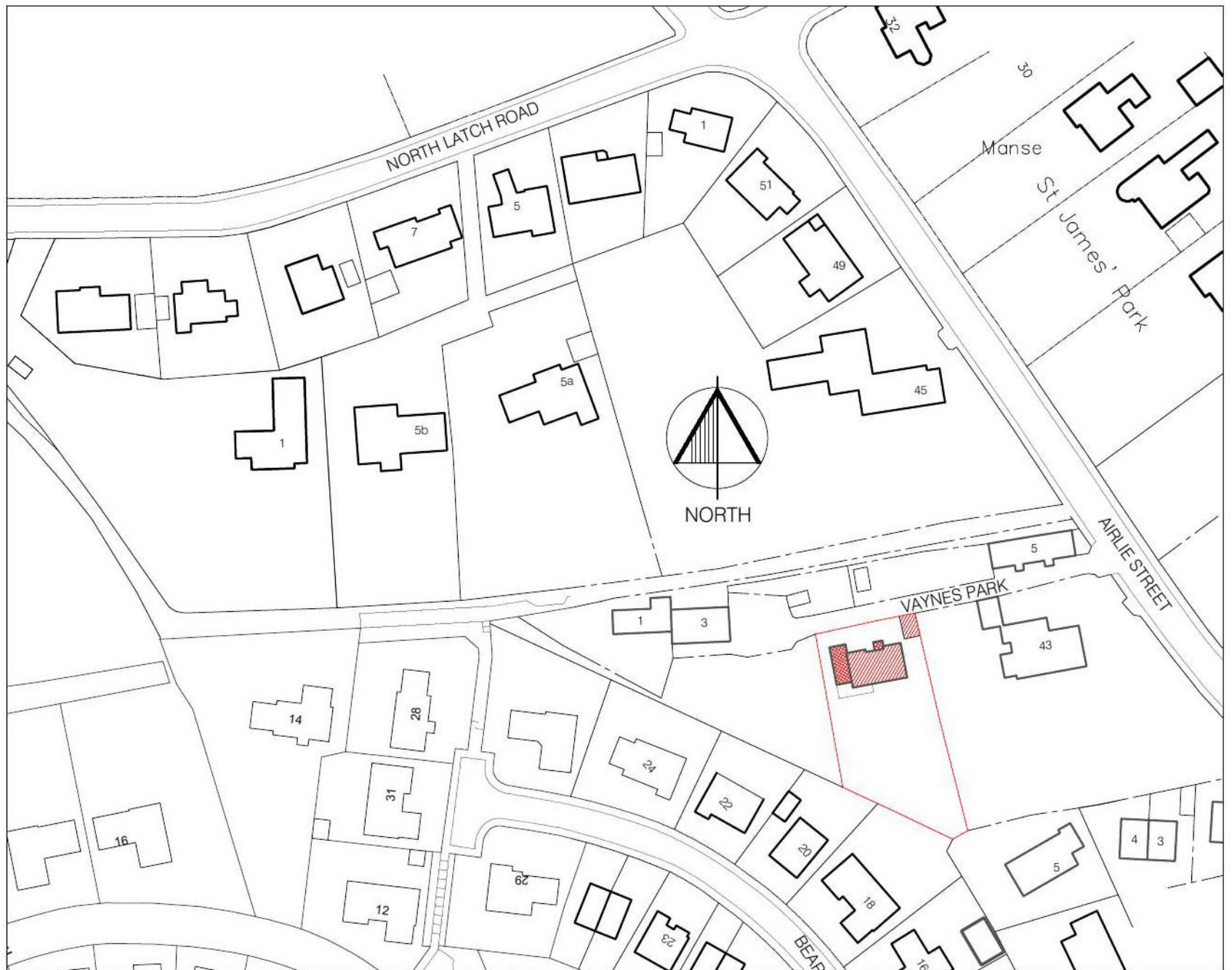
LOCATION PLAN 1:1250 0 20 40 60 80 100 SCALE OF METRES = 1:1250

Contains Ordnance Survey data. © Crown copyright and database right 2023. AC0000849494