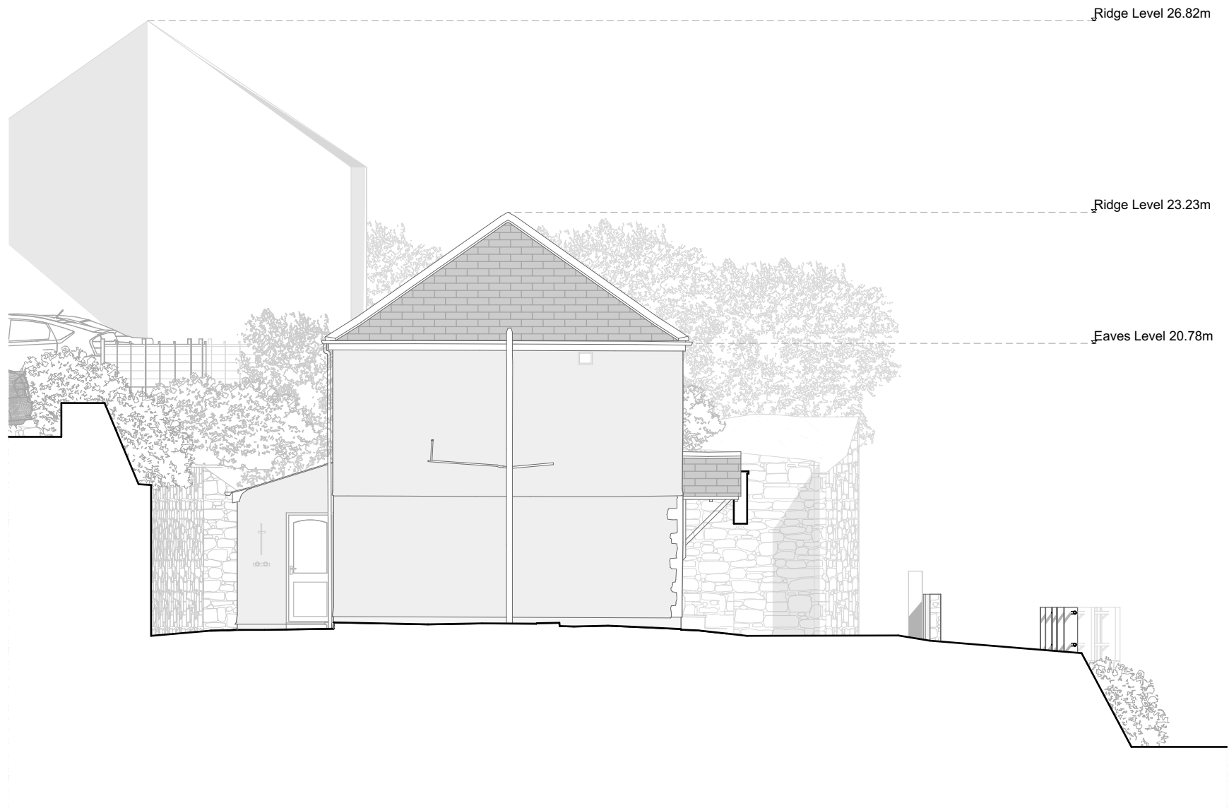
S 01 EXISTING SOUTH ELEVATION 1:100