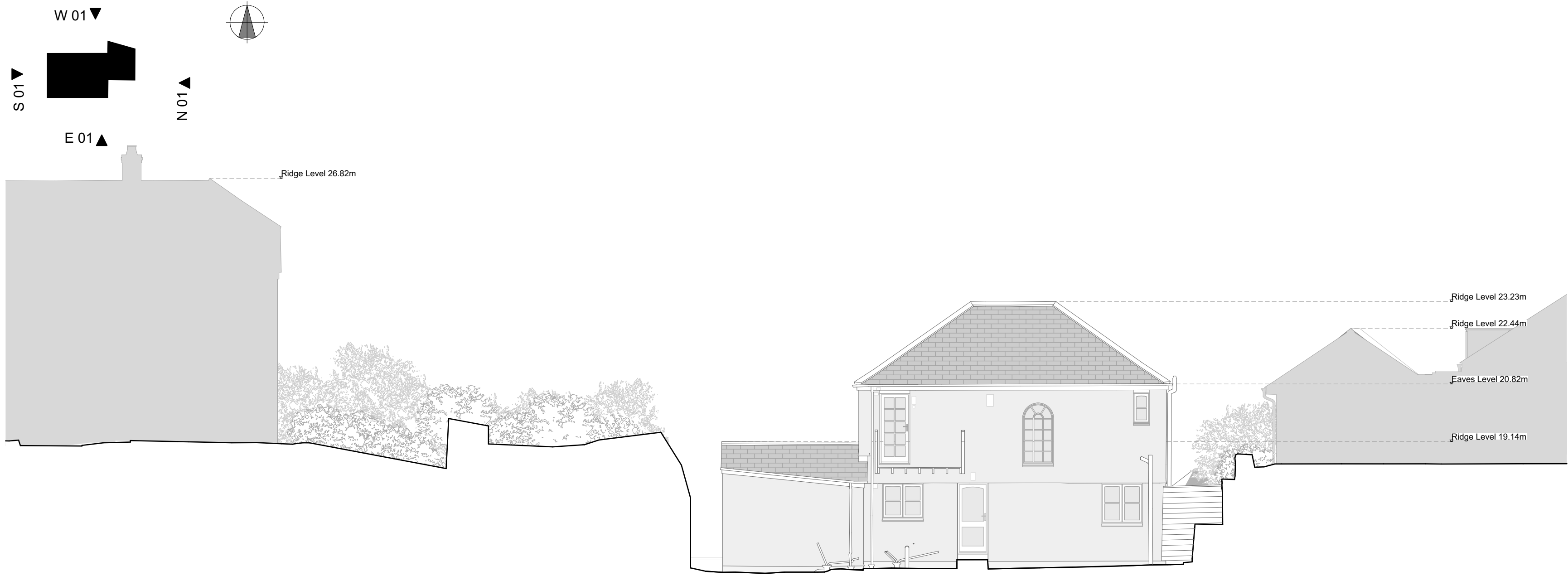
EXISTING WEST ELEVATION 1:100