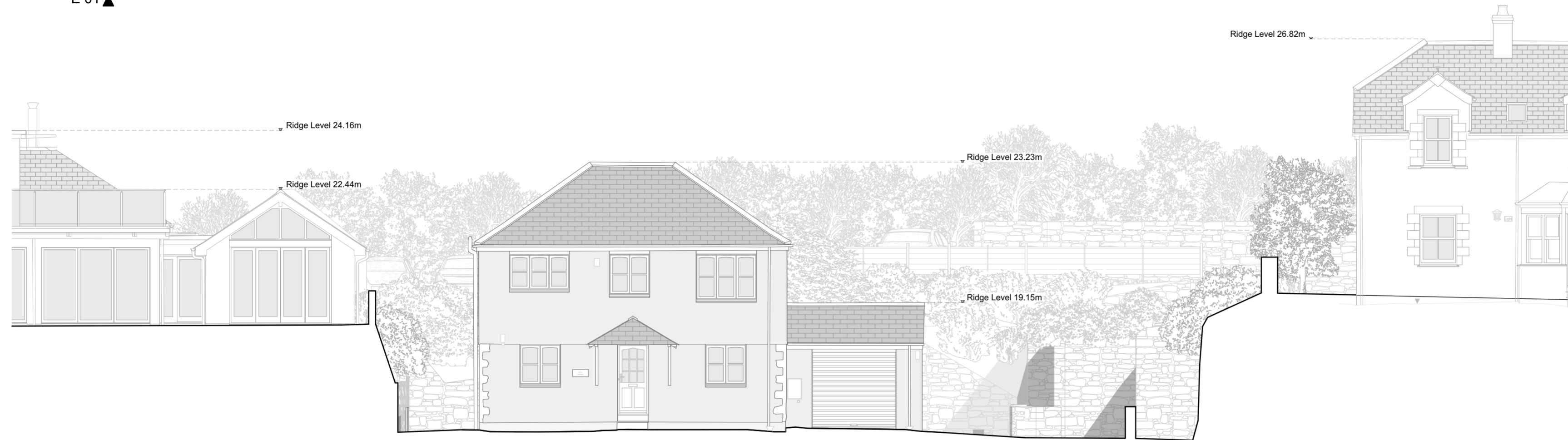
E 01 EXISTING EAST ELEVATION 1:100