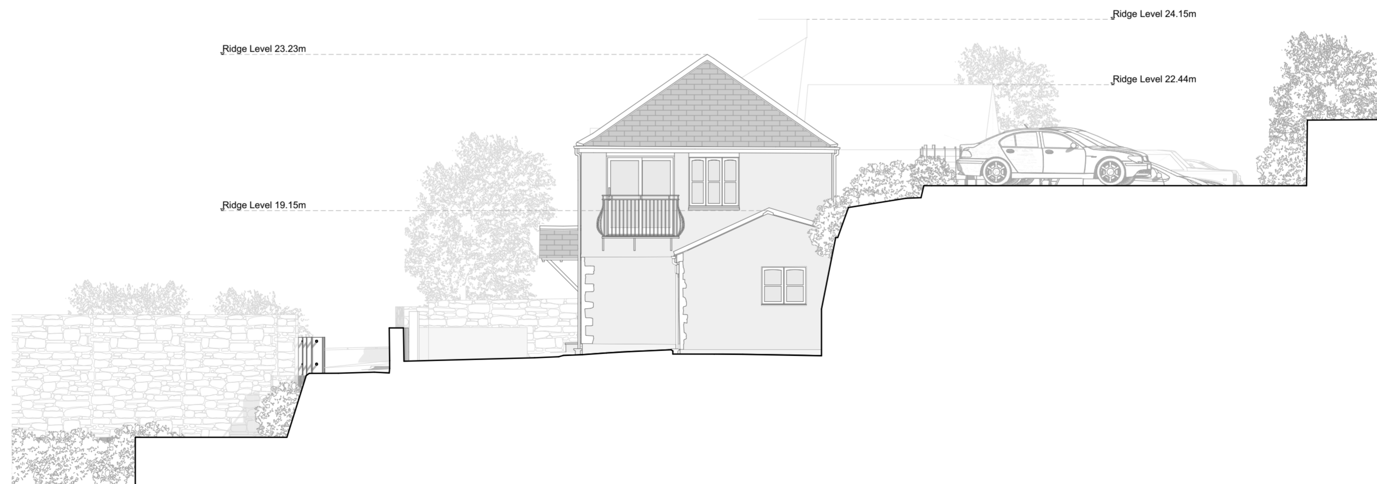
EXISTING NORTH ELEVATION 1:100