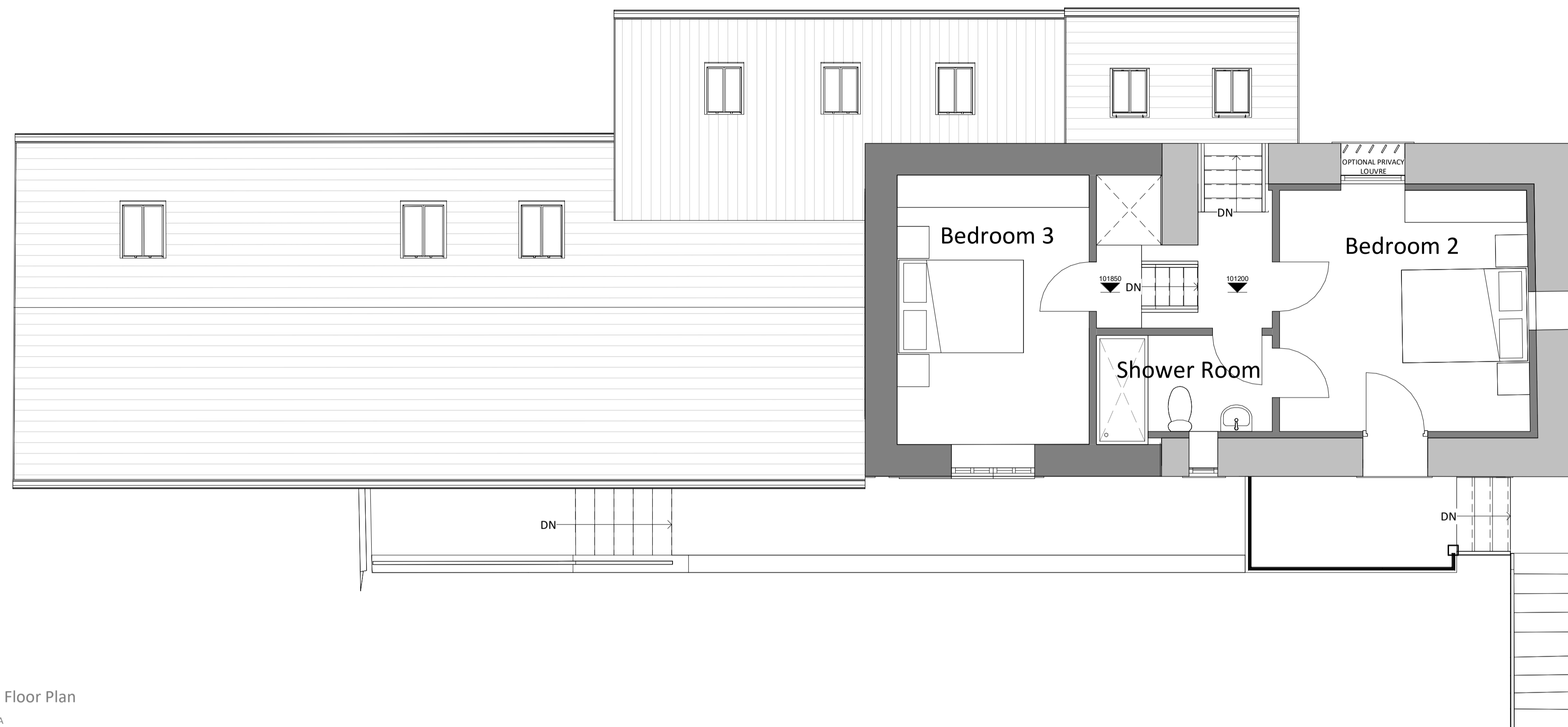
1 First Floor Plan