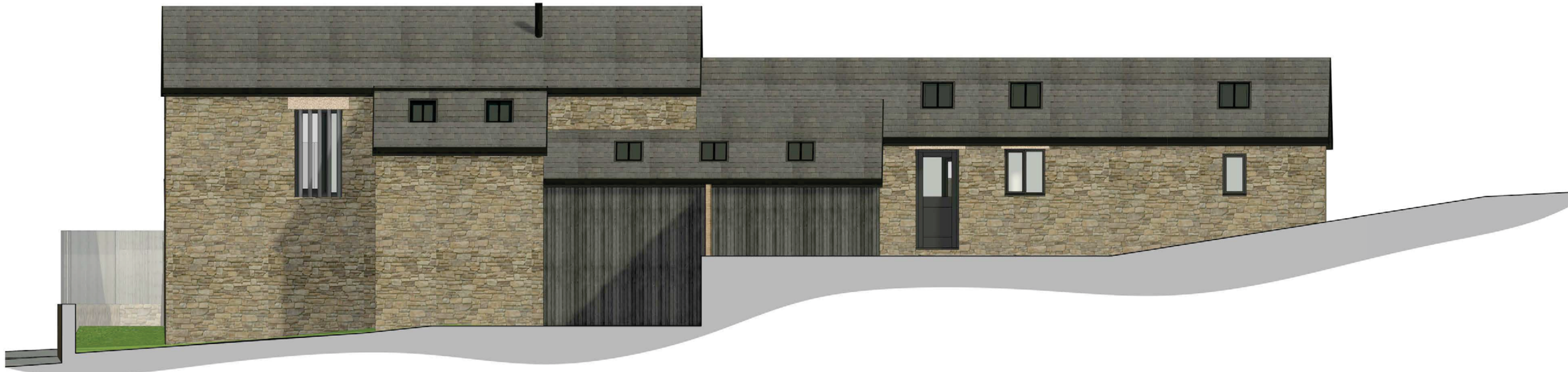
1 North Elevation