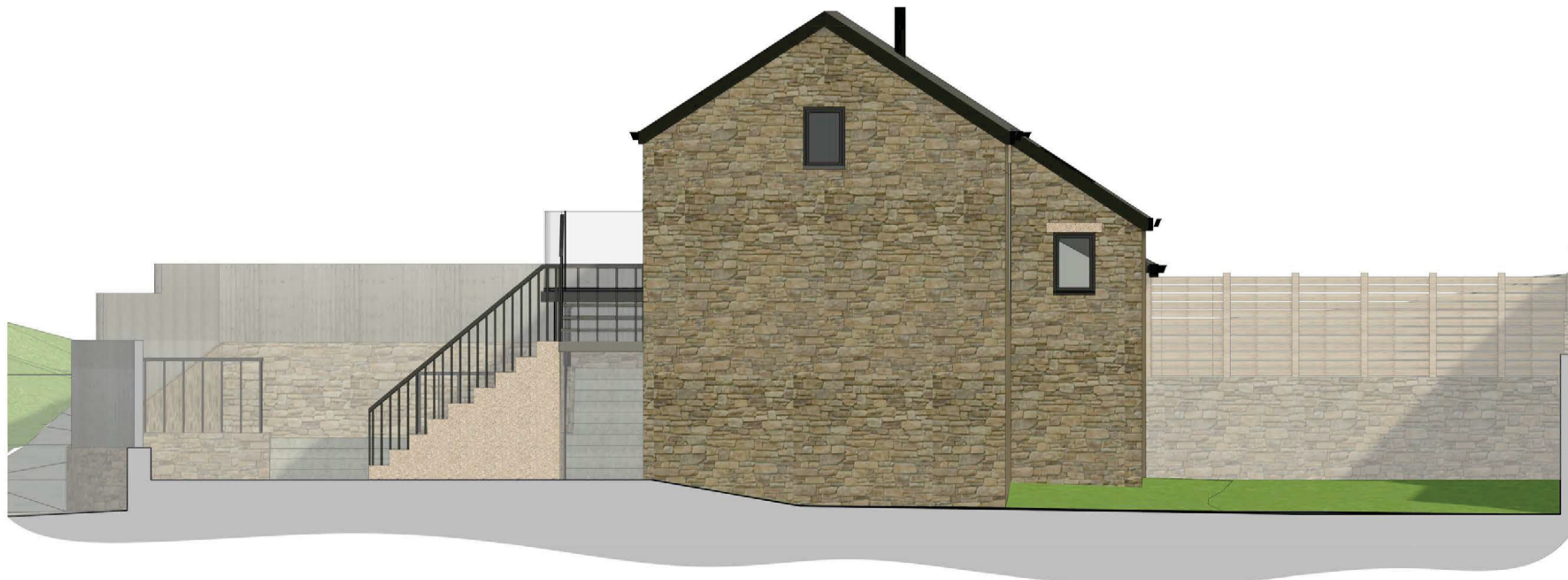
2 East Elevation