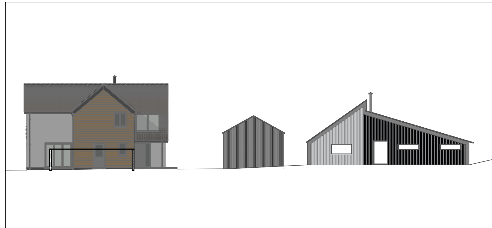
1:200 proposed elevations