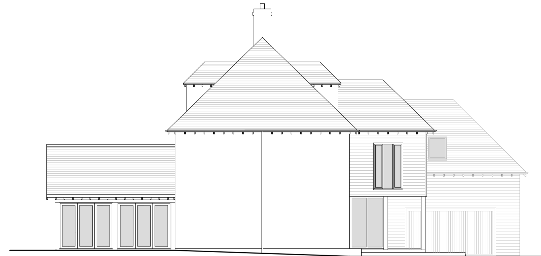
East Elevation - 1:100