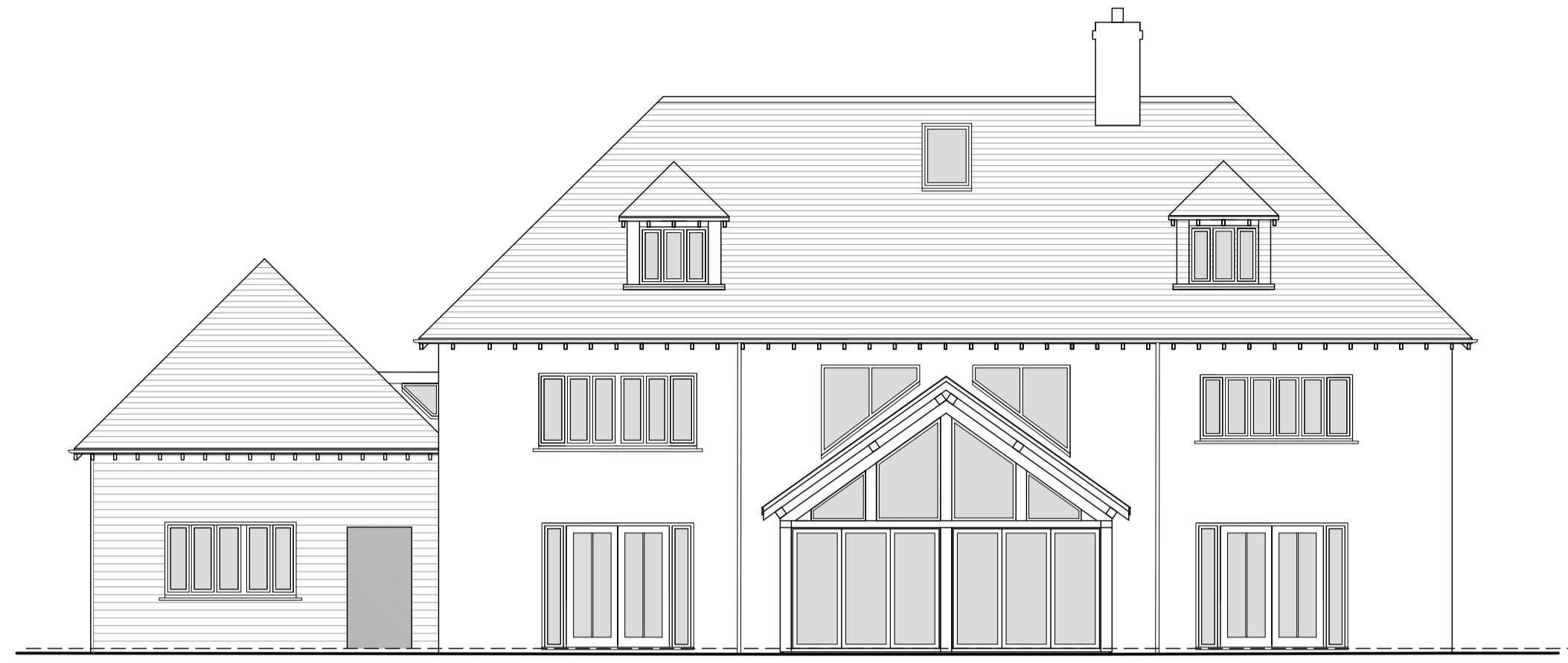
South Elevation - 1:100