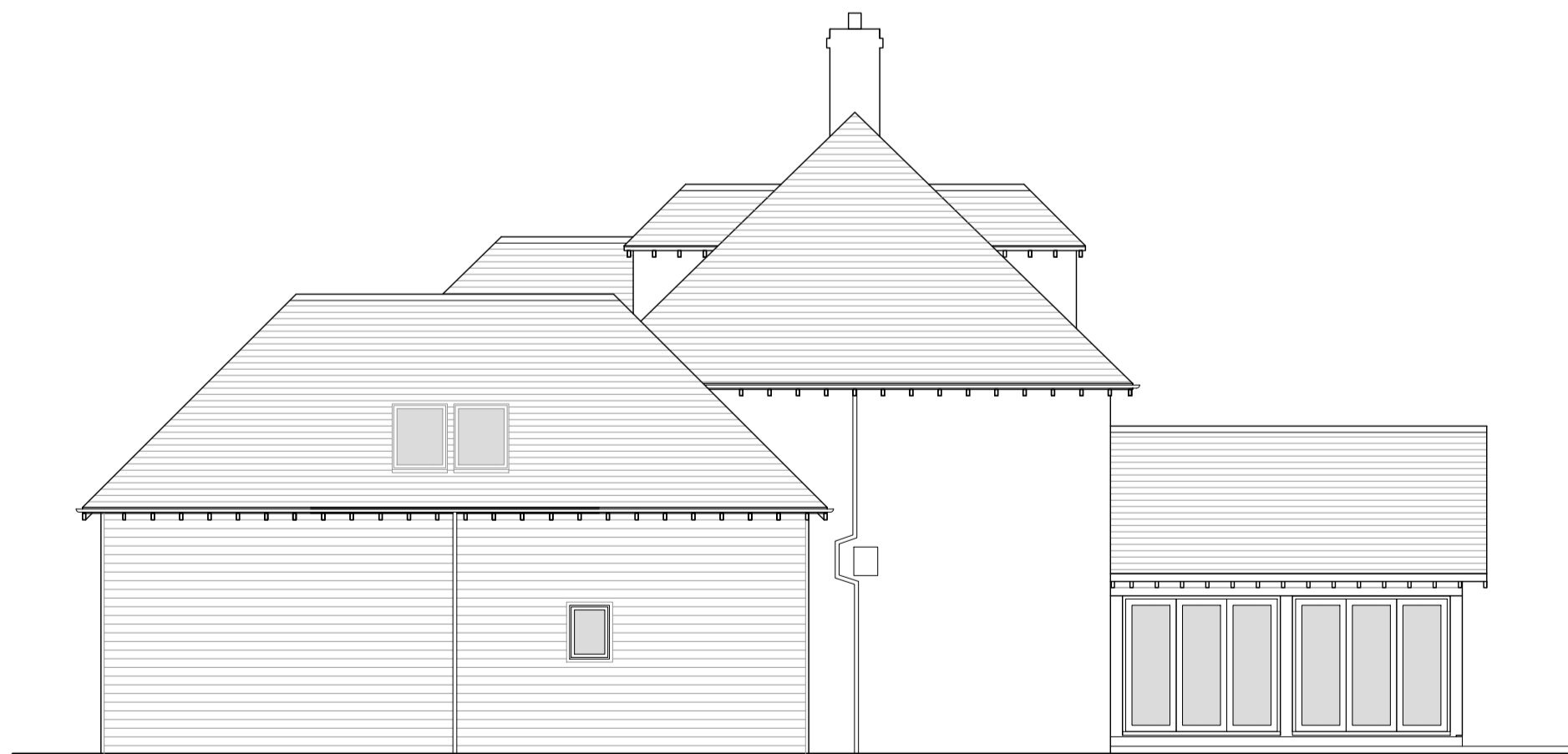
West Elevation - 1:100