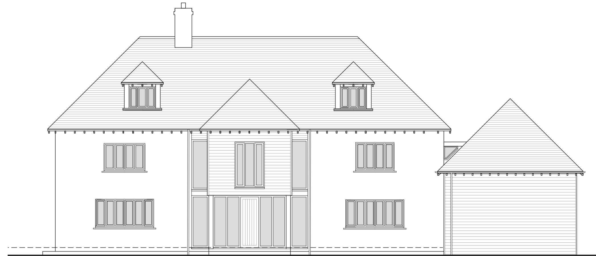
North Elevation - 1:100