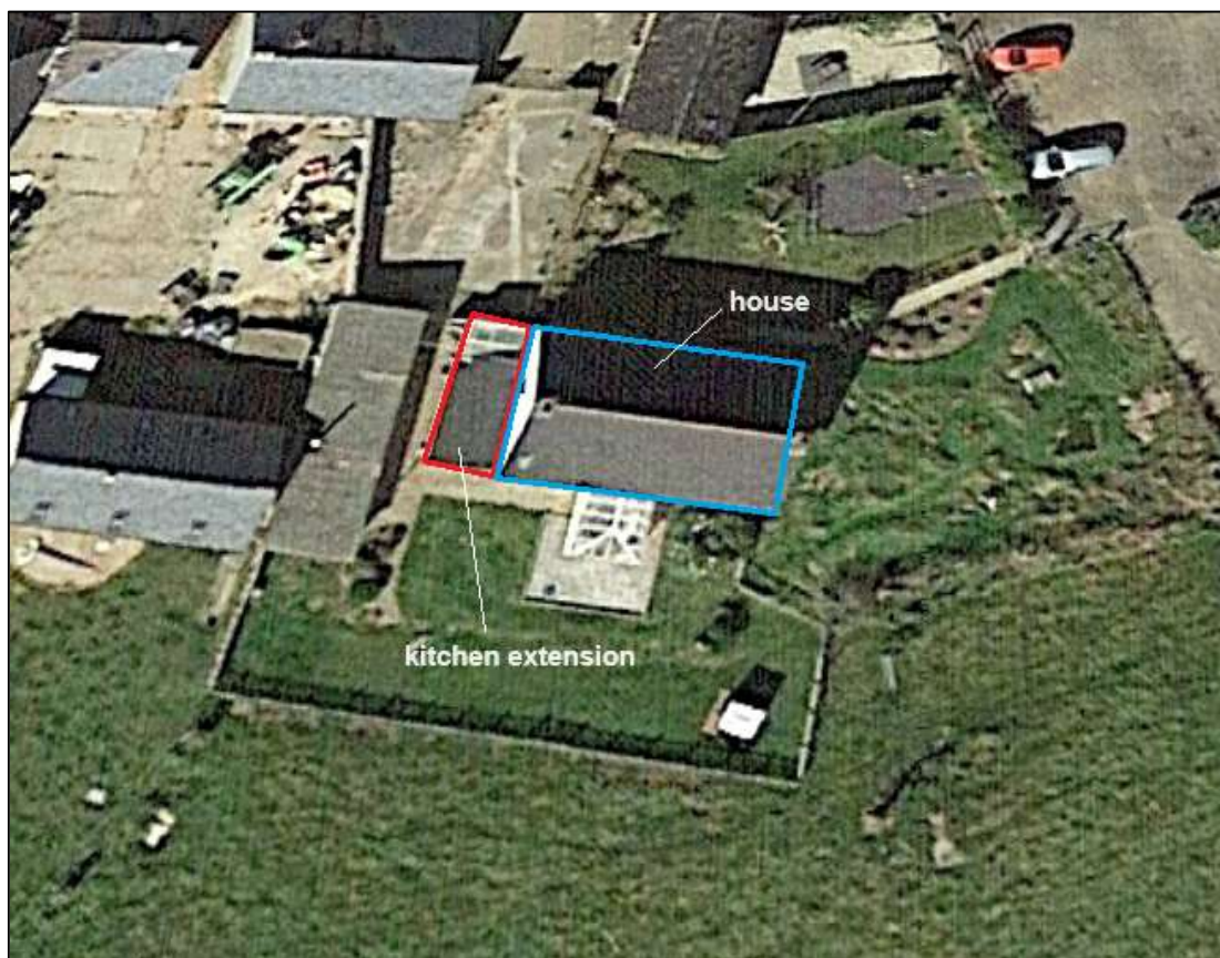
Figure 1. Location of the building. GoogleEarth June 2019.

SWE was commissioned by M & A White to undertake an ecological assessment of a ground floor kitchen extension at Weeke Farm, Pennymoor, Devon, EX16 8PG (Ordnance Survey grid reference SS 851116 – see Figure 1). The survey was required to support a planning application relating to the existing mono-pitch kitchen extension. There will be no impacts on the main house roof. The Devon Wildlife Checklist is appended to this report.