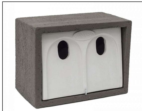
Figure 2. Vivara Pro Woodstone House Sparrow Nest Box.

Enhancement for nesting birds as part of the planning application should comprise of 2 no. Vivara Pro Woodstone House Sparrow Nest Boxes (double chamber) 10 or equivalent (Figure 2). The boxes should be located as high as possible to the north or east elevation of the main house. Plans should show the location of the bird boxes.