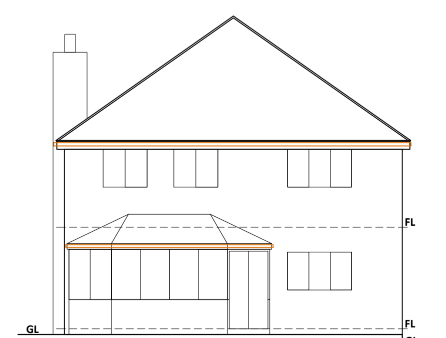
REAR ELEV. 1:100