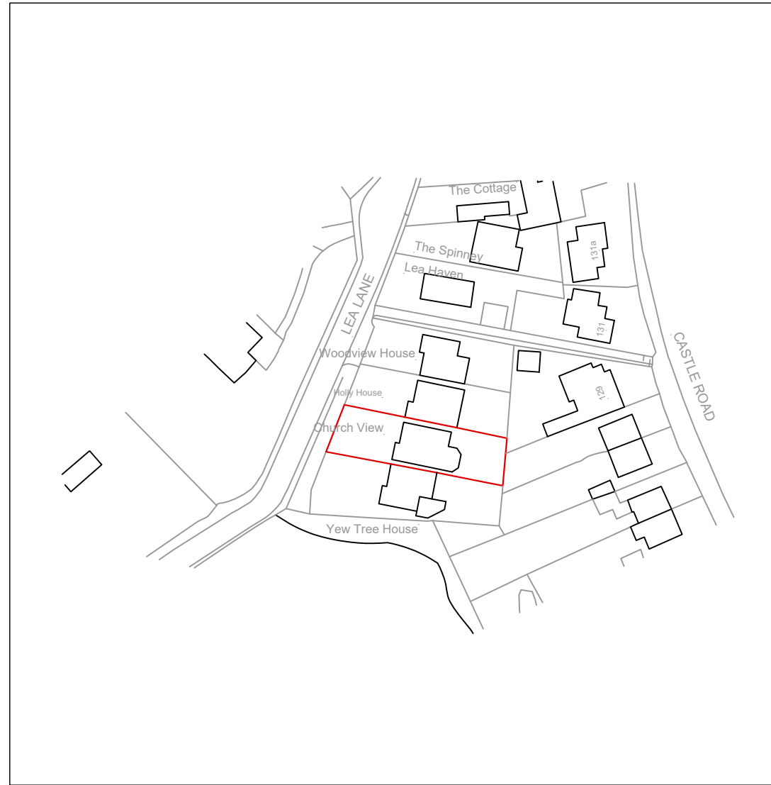
EXISTING LOCATION PLAN 1:1250