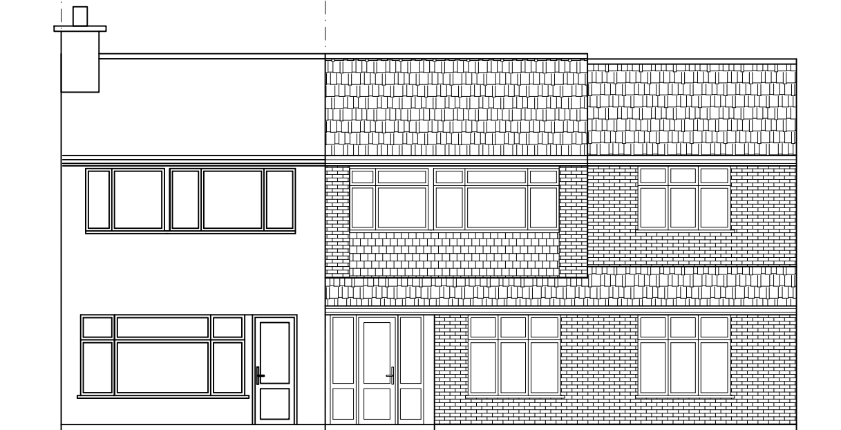
PROPOSED FRONT STREET SCENE