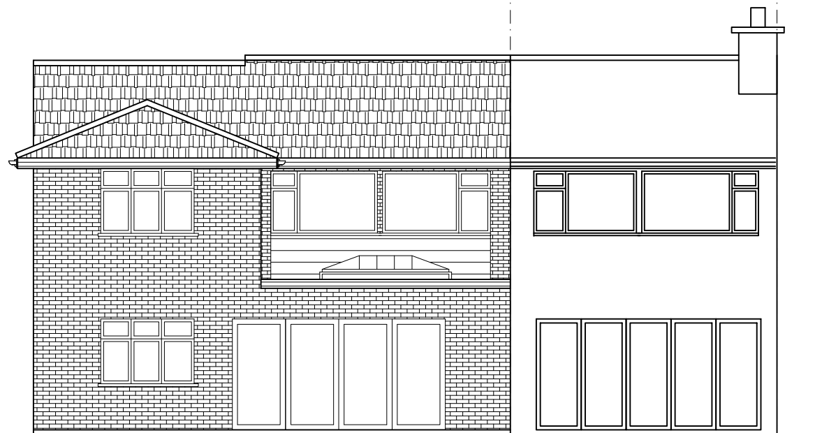
PROPOSED REAR GARDEN SCENE

PARTY WALL NOTICES: PLEASE NOTE THAT BEFORE BUILDING WORKS COMMENCES IT IS THE RESPONSIBILITY OF BUILDER OR OWNER TO SERVE PARTY WALL NOTICES TO ALL NEIGHBOURS