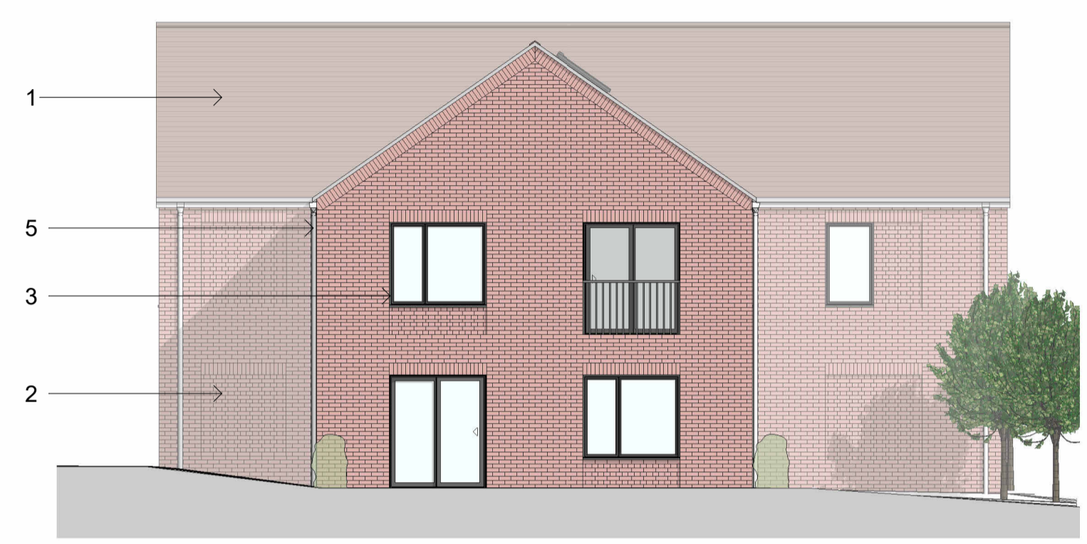
1 West Elevation 1 : 100