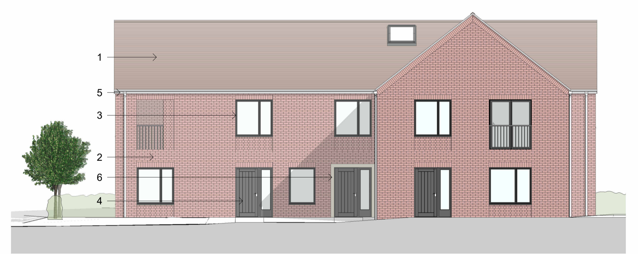
4 South Elevation 1 : 100