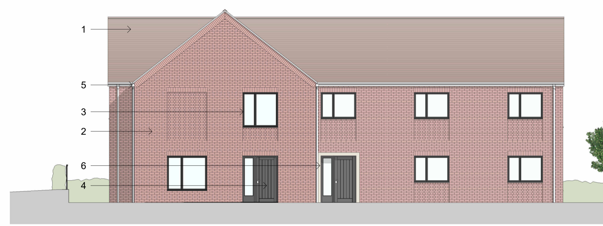
2 North Elevation 1 : 100