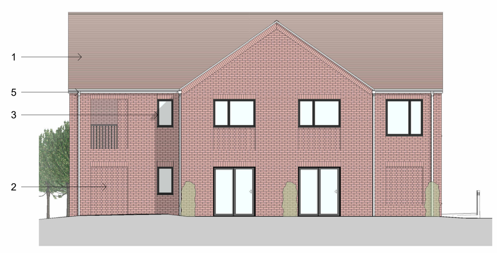
3 East Elevation 1 : 100