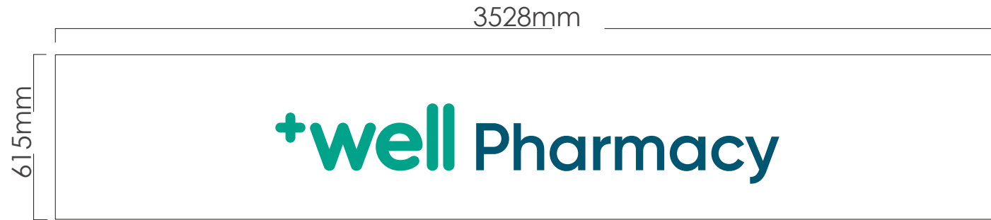
Item 1 Scale 1:20 @ A3