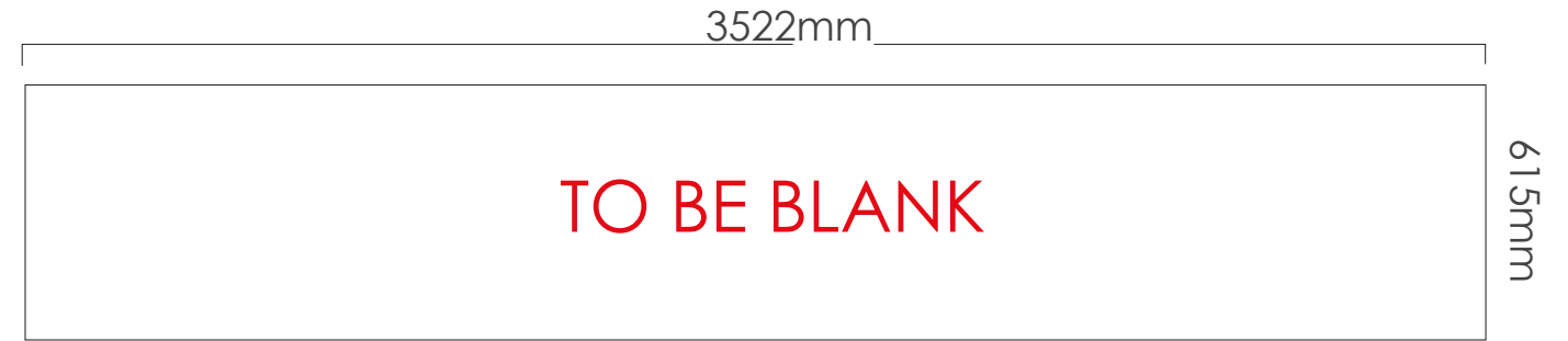
Item 2 Scale 1:20 @ A3