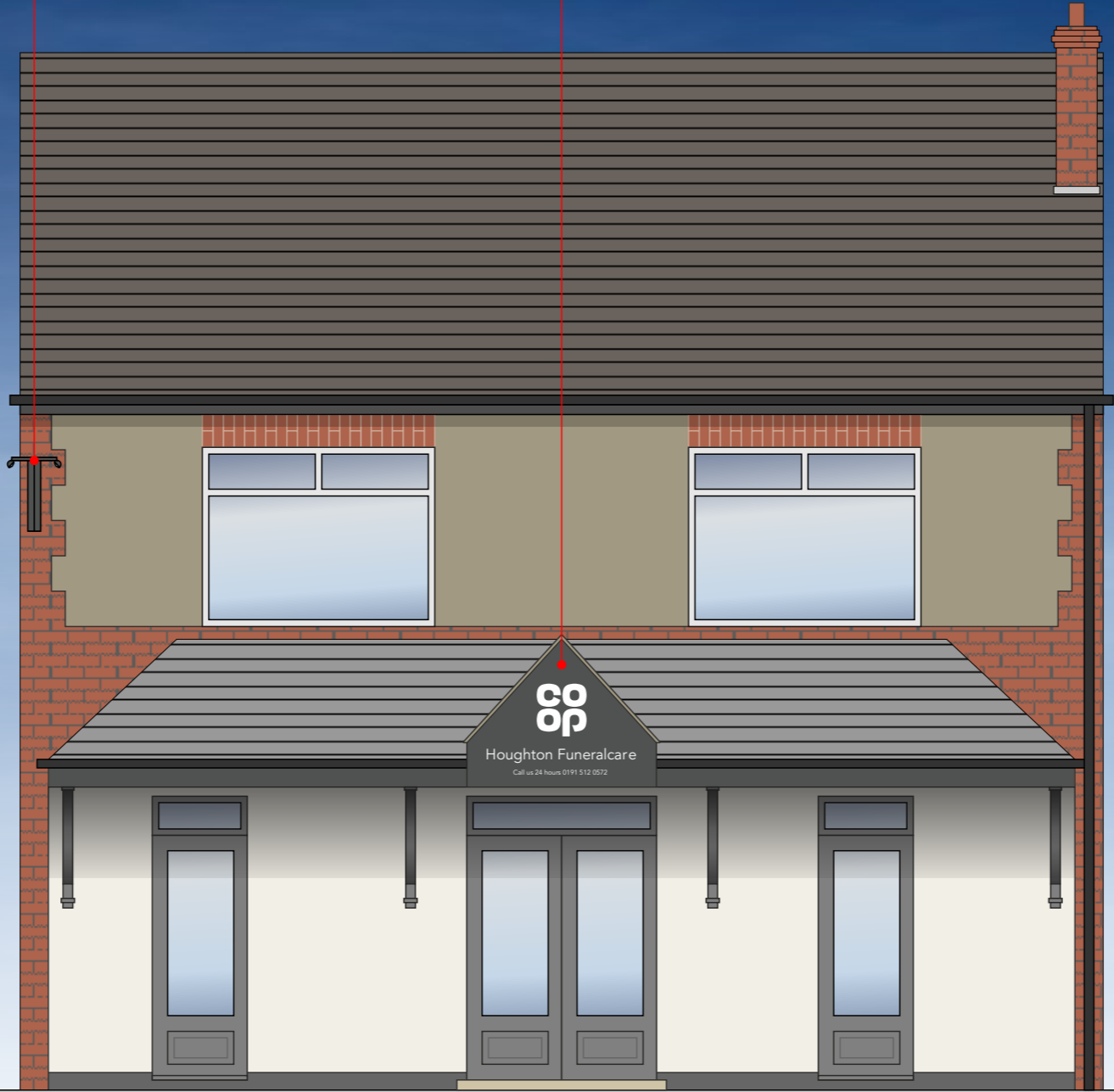
Entrance Elevation 1:50@A3