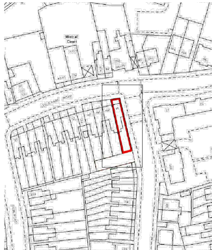
Site Location Plan - Scale 1:1250