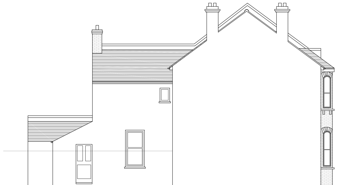
Existing Left Side Elevation Scale 1:100