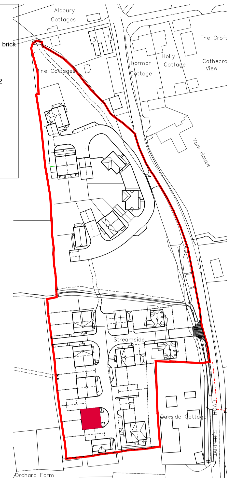
KEY PLAN 1:1000