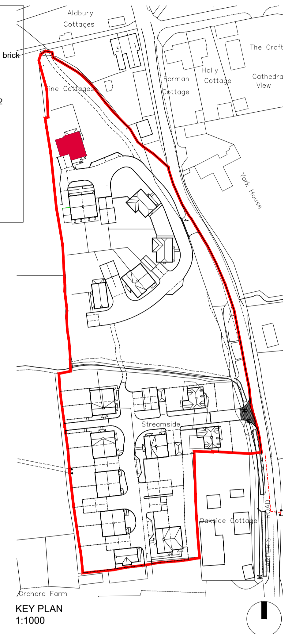
KEY PLAN 1:1000