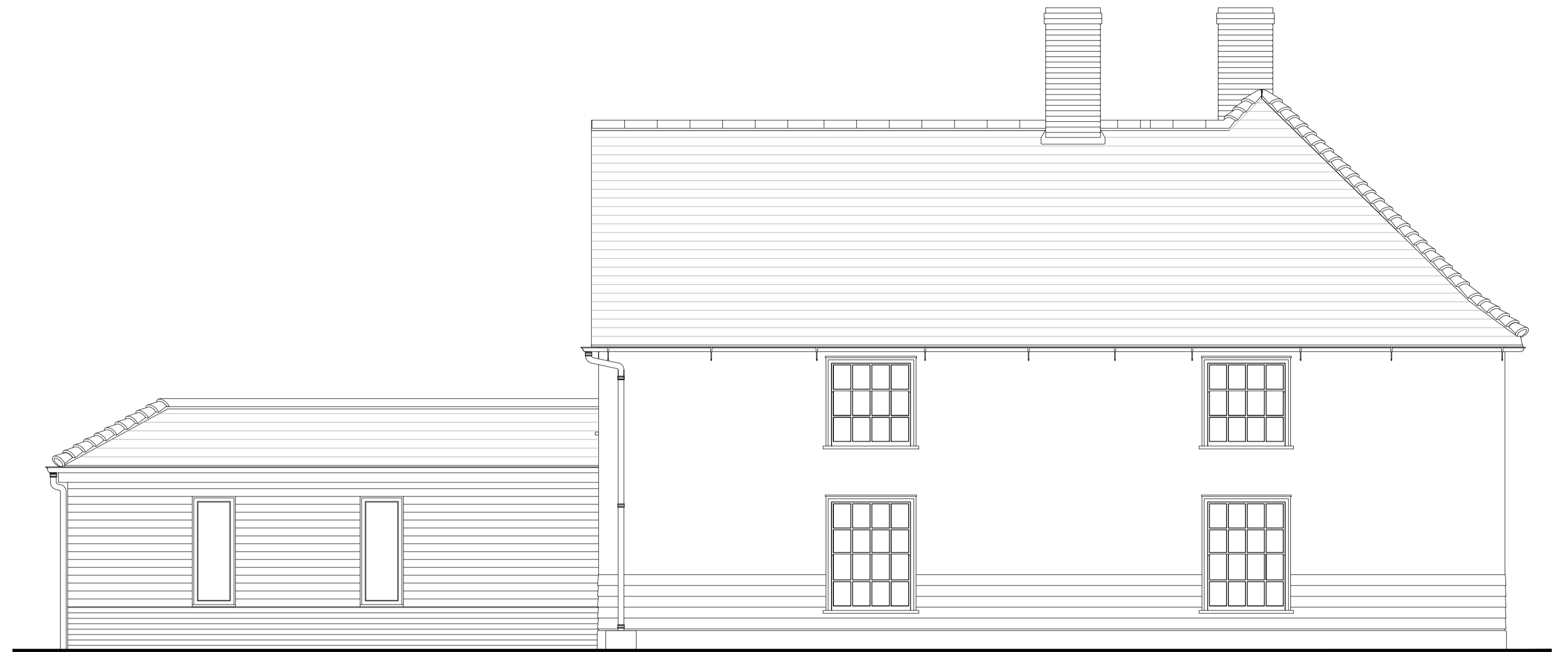
Proposed Side Elevation Scale 1:50