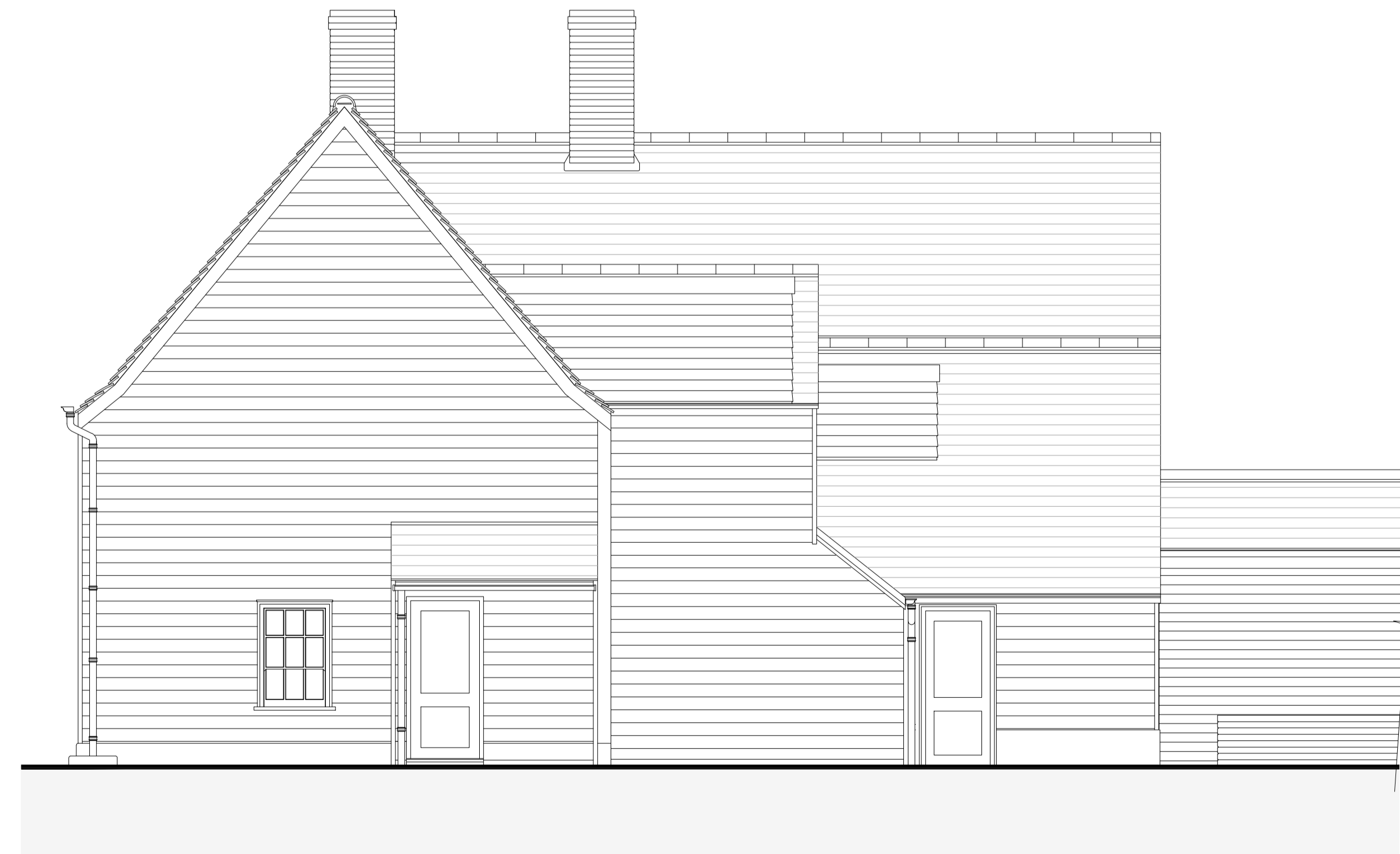
Proposed Side Elevation Scale 1:50

Note: Drawings based on approved application No: HW/FUL/18/00463 and HW/LBC/18/00362