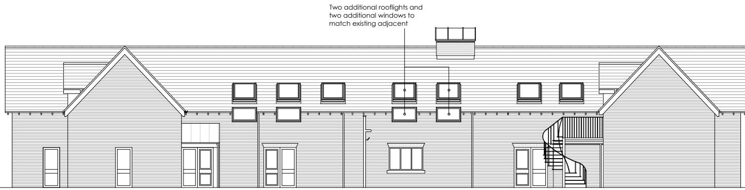
Proposed East Elevation