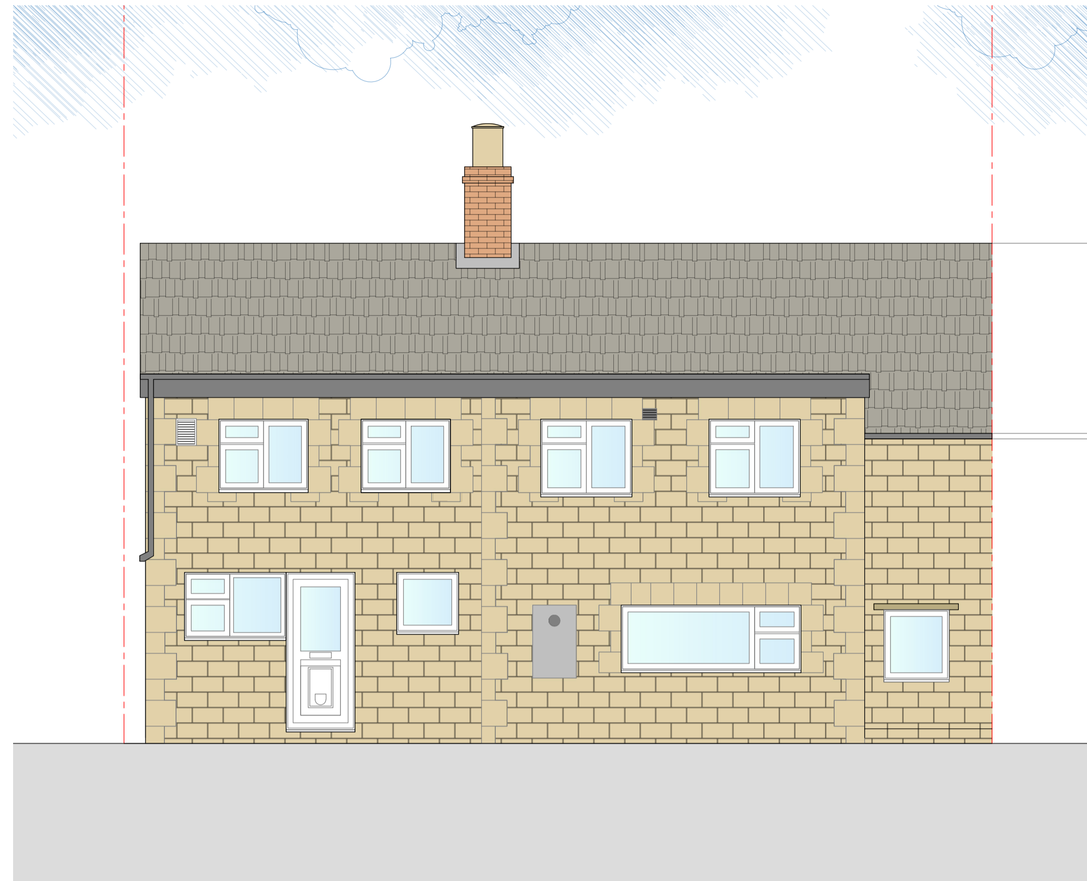
Existing Rear Elevation Scale 1:50