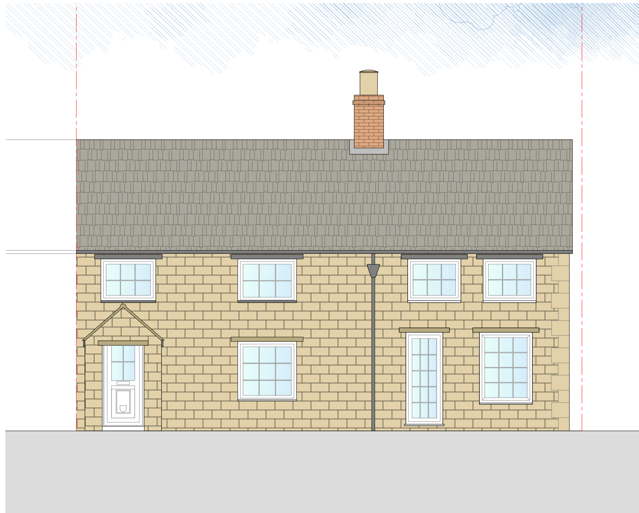
Existing Front Elevation Scale 1:50