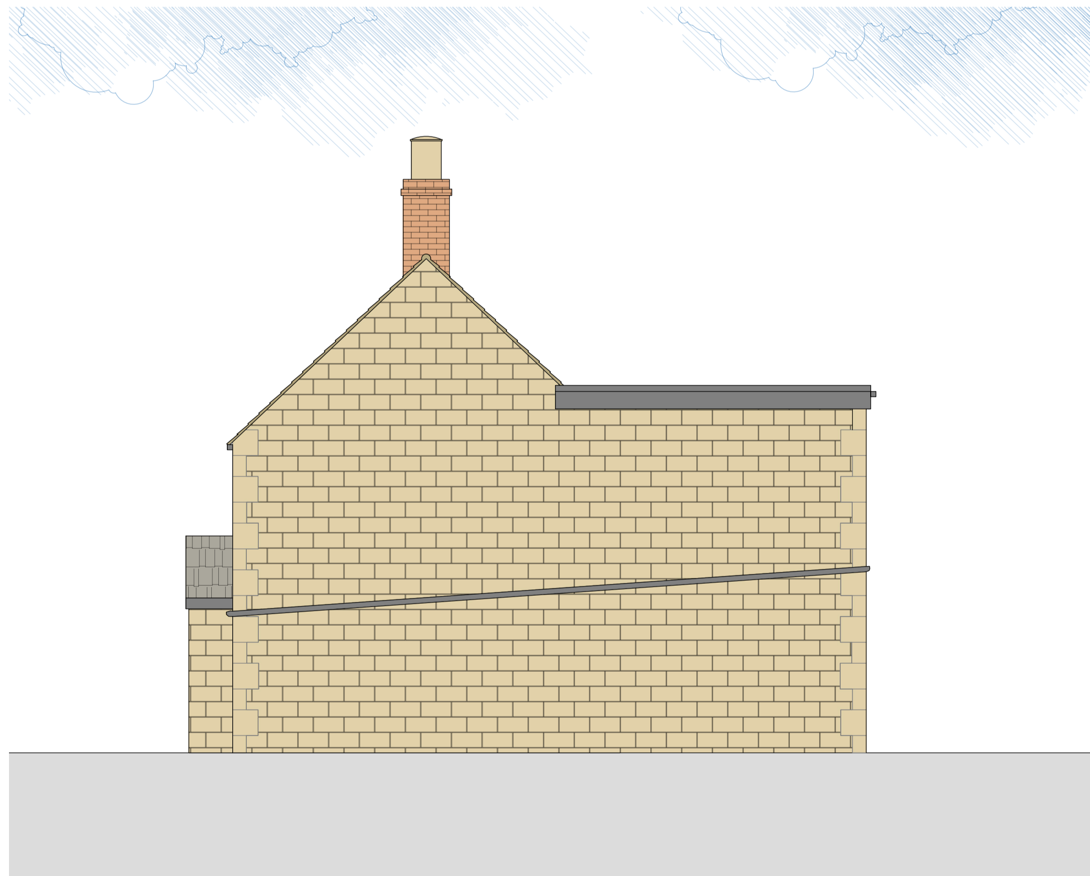
Existing Side Elevation Scale 1:50