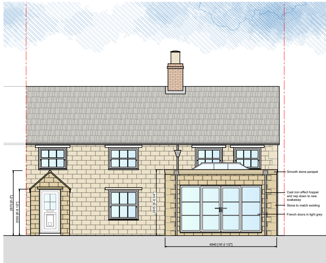
Proposed Front Elevation Scale 1:50