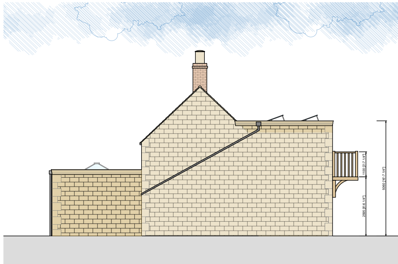
Proposed East Side Elevation Scale 1:50