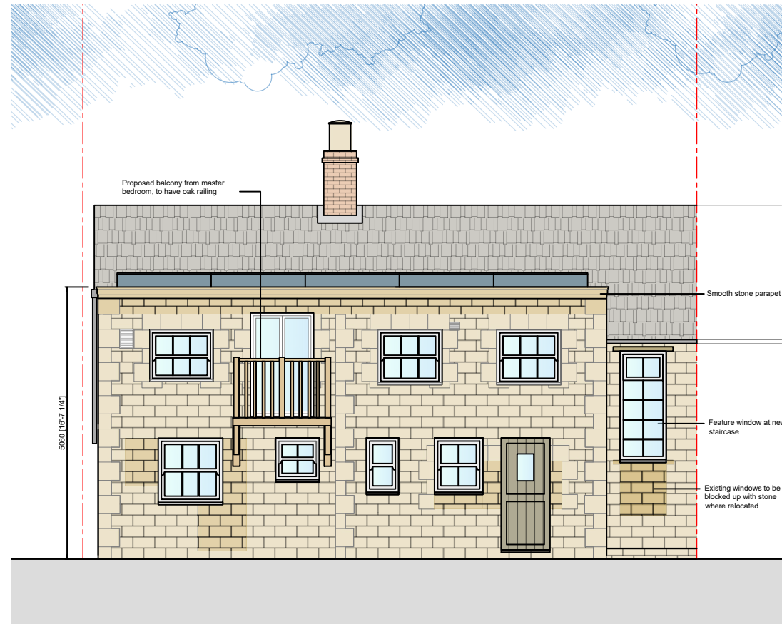
Proposed Rear Elevation Scale 1:50