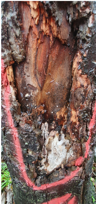
Picture showing close up of dead bark/impact damage

As this is a courtyard , it is recommended that a tree is planted in a better location away from this public area.