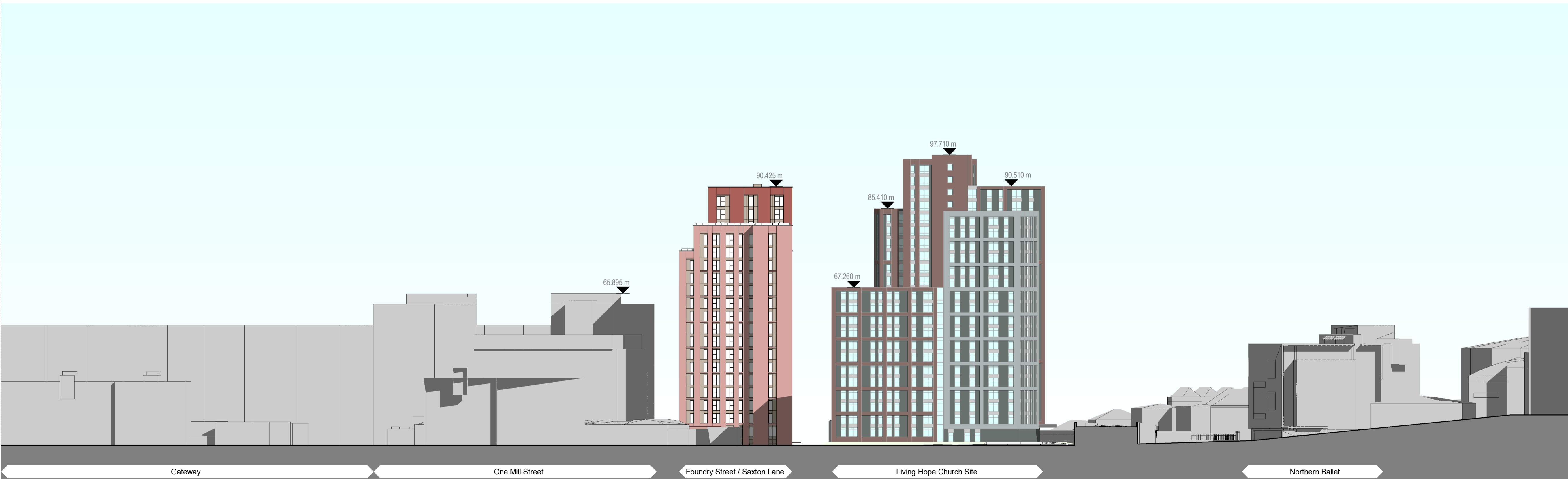
2 Elevation - East Context 1 : 500