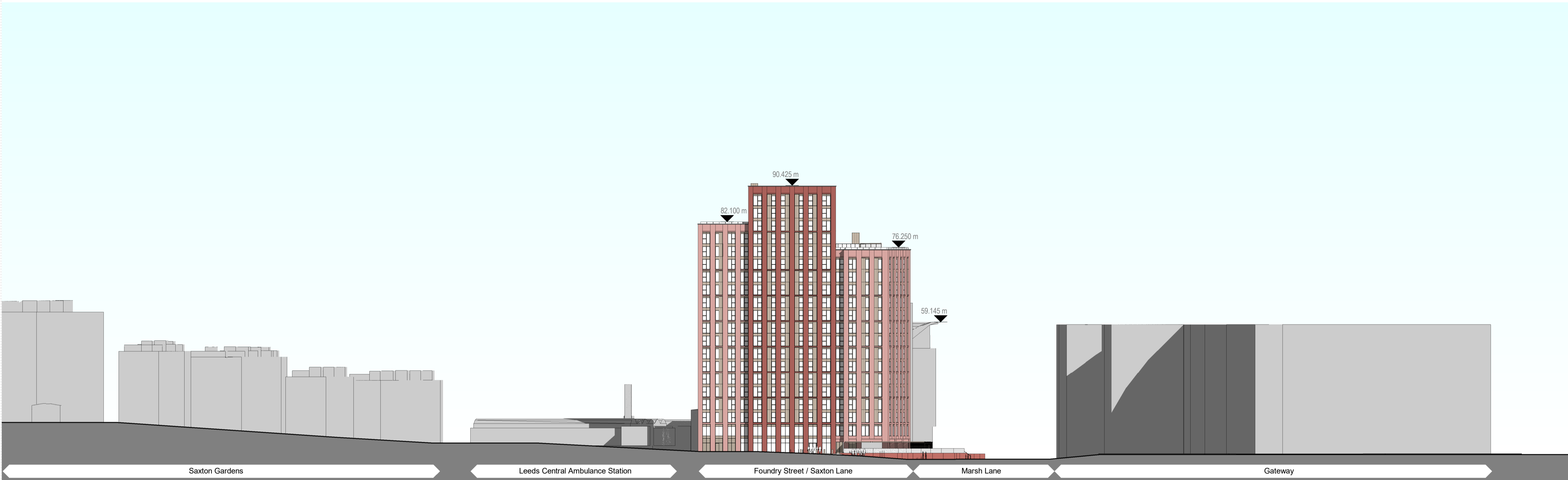
1 Elevation - North Context 1 : 500