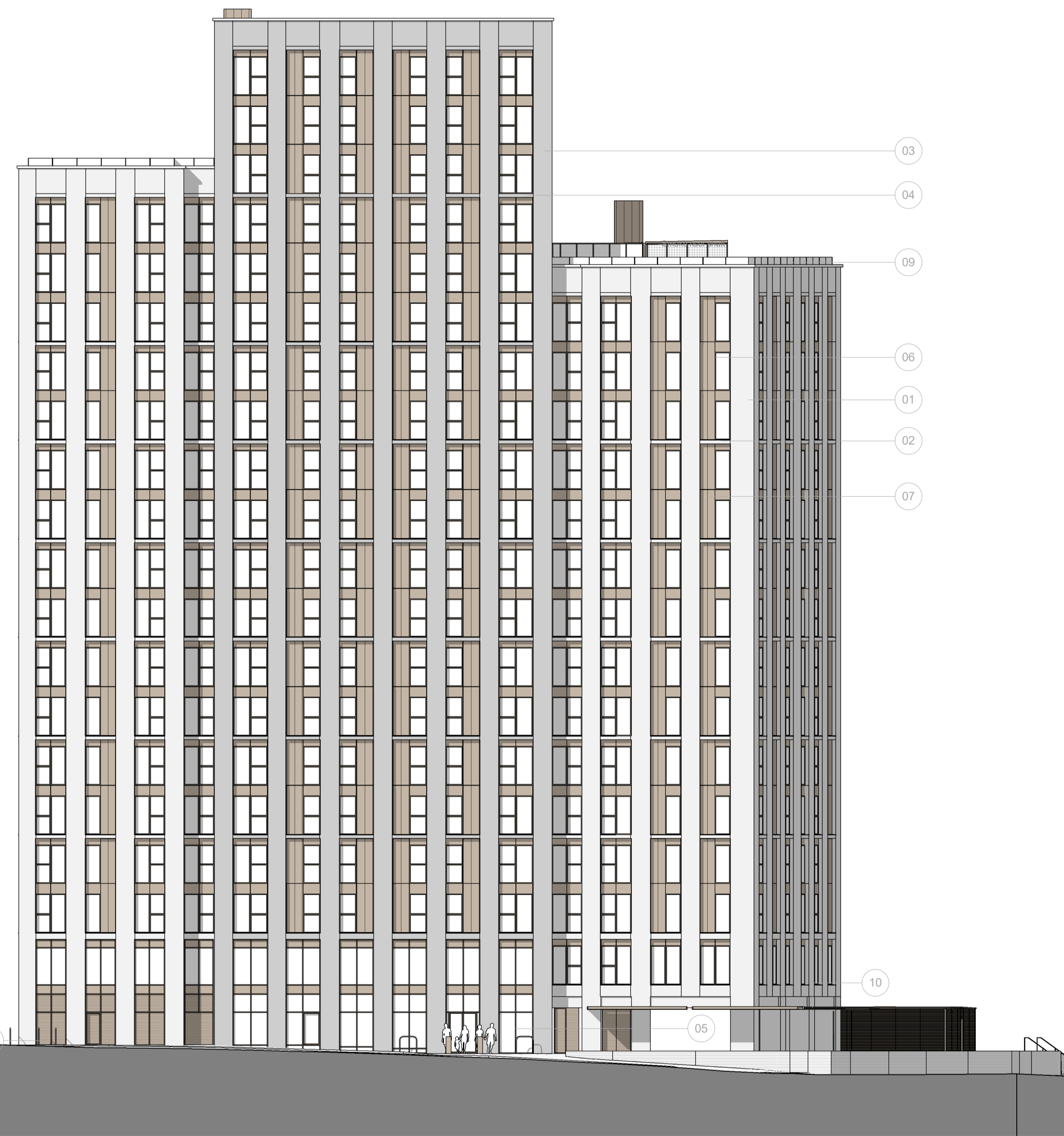
1 Elevation - North 1 : 200

FFL 88.775 m ▼ Level 20 FFL 85.850 m ▼ Level 19 FFL 82.925 m ▼ Level 18 FFL 80.000 m ▼ Level 17 FFL 77.075 m ▼ Level 16 FFL 74.150 m ▼ Level 15 FFL 71.225 m ▼ Level 14 FFL 68.300 m ▼ Level 13 FFL 65.375 m ▼ Level 12 FFL 62.450 m ▼ Level 11 FFL 59.525 m ▼ Level 10 FFL 56.600 m ▼ Level 09 FFL 53.675 m ▼ Level 08 FFL 50.750 m ▼ Level 07 FFL 47.825 m ▼ Level 06 FFL 44.900 m ▼ Level 05 FFL 41.975 m ▼ Level 04 FFL 39.050 m ▼ Level 03 FFL 36.125 m ▼ Level 02 FFL 33.050 m ▼ Level 01 FFL 29.000 m ▼ Level 00