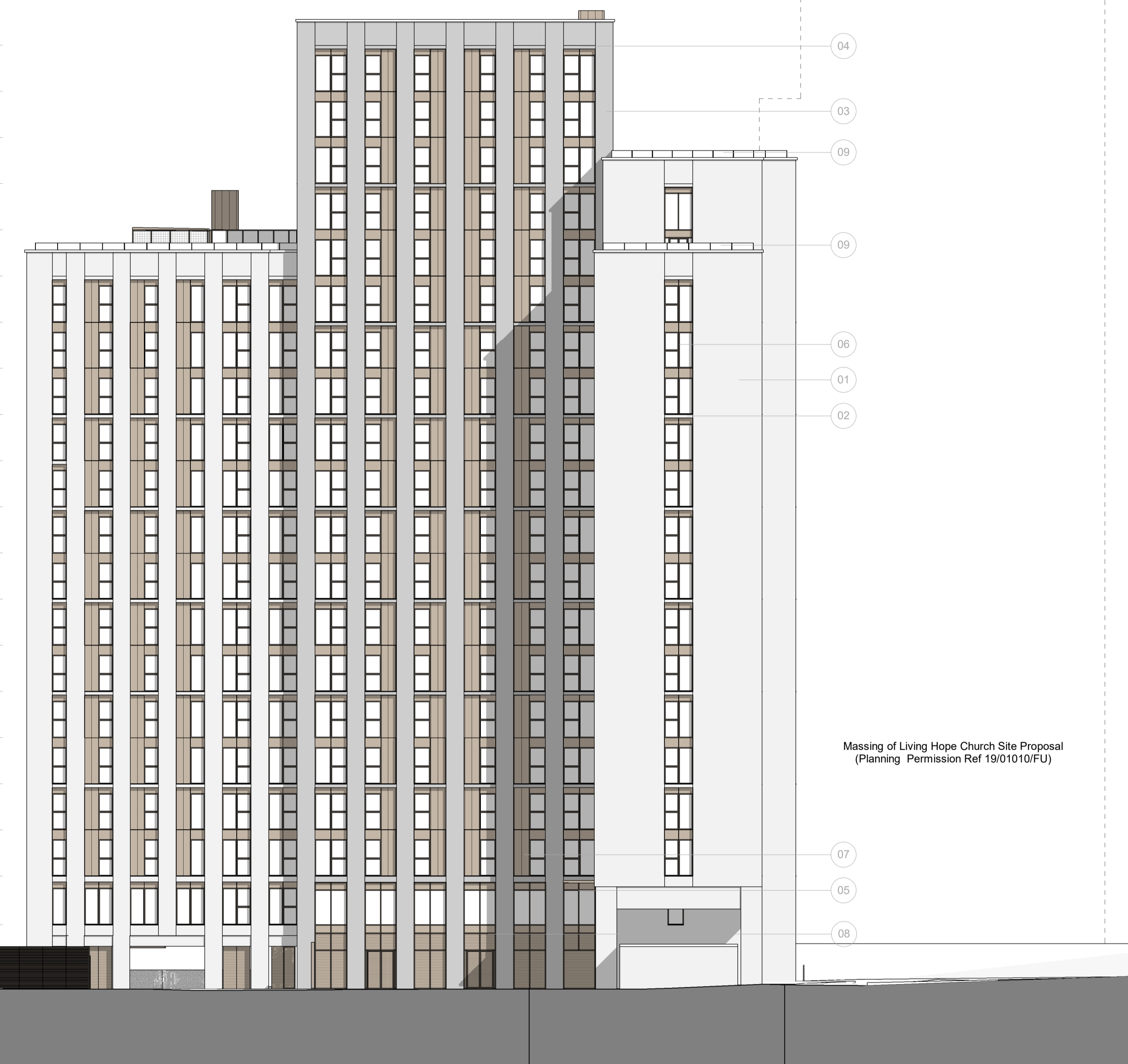
2 Elevation - South 1 : 200

FFL 88.775 m ▼ Level 20 FFL 85.850 m ▼ Level 19 FFL 82.925 m ▼ Level 18 FFL 80.000 m ▼ Level 17 FFL 77.075 m ▼ Level 16 FFL 74.150 m ▼ Level 15 FFL 71.225 m ▼ Level 14 FFL 68.300 m ▼ Level 13 FFL 65.375 m ▼ Level 12 FFL 62.450 m ▼ Level 11 FFL 59.525 m ▼ Level 10 FFL 56.600 m ▼ Level 09 FFL 53.675 m ▼ Level 08 FFL 50.750 m ▼ Level 07 FFL 47.825 m ▼ Level 06 FFL 44.900 m ▼ Level 05 FFL 41.975 m ▼ Level 04 FFL 39.050 m ▼ Level 03 FFL 36.125 m ▼ Level 02 FFL 33.050 m ▼ Level 01 FFL 29.000 m ▼ Level 00