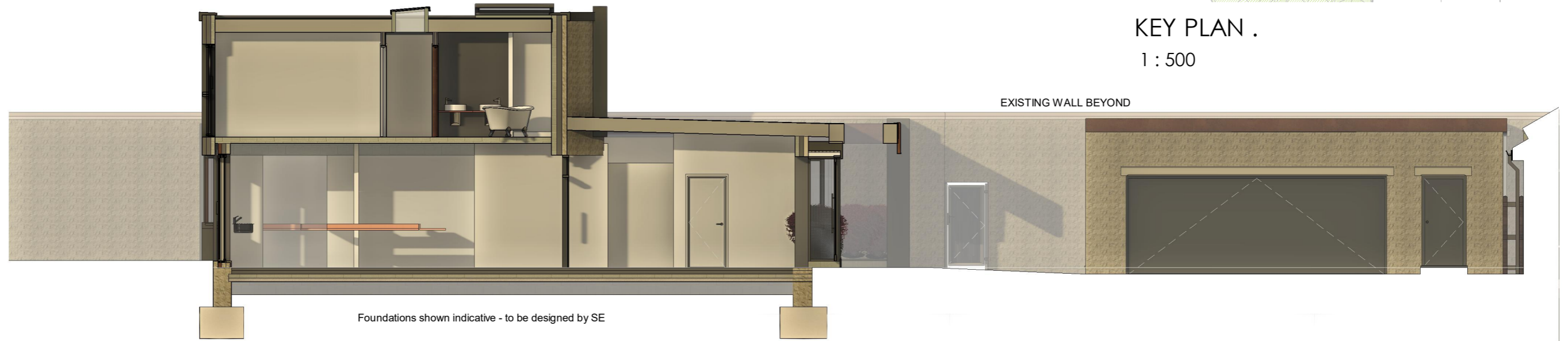
Proposed Section A-A