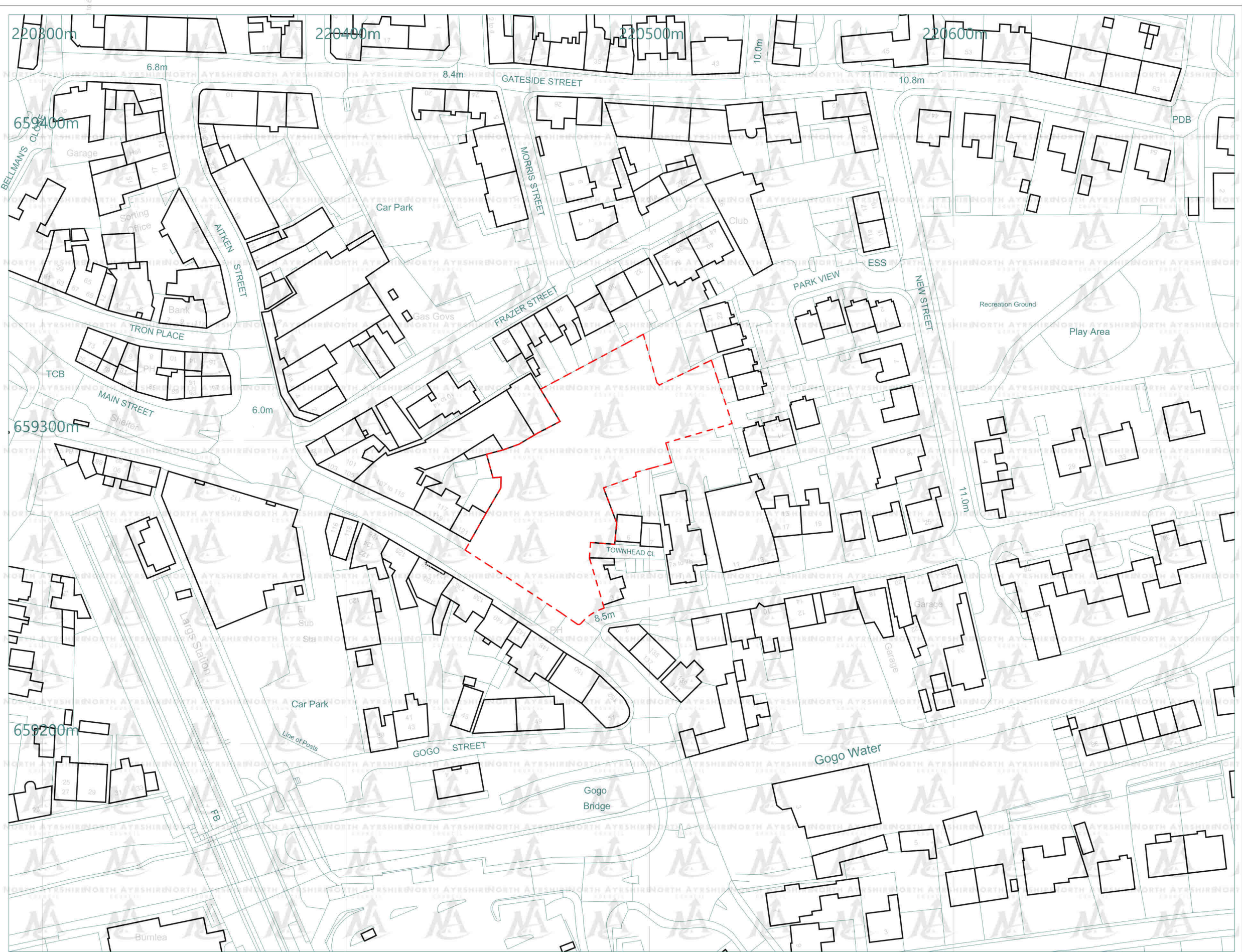
1 Site Location Plan 1 : 1250