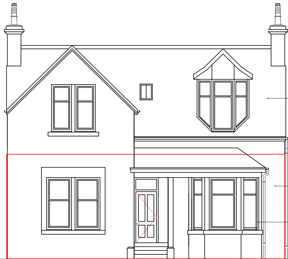
Existing South Elevation Scale 1:100