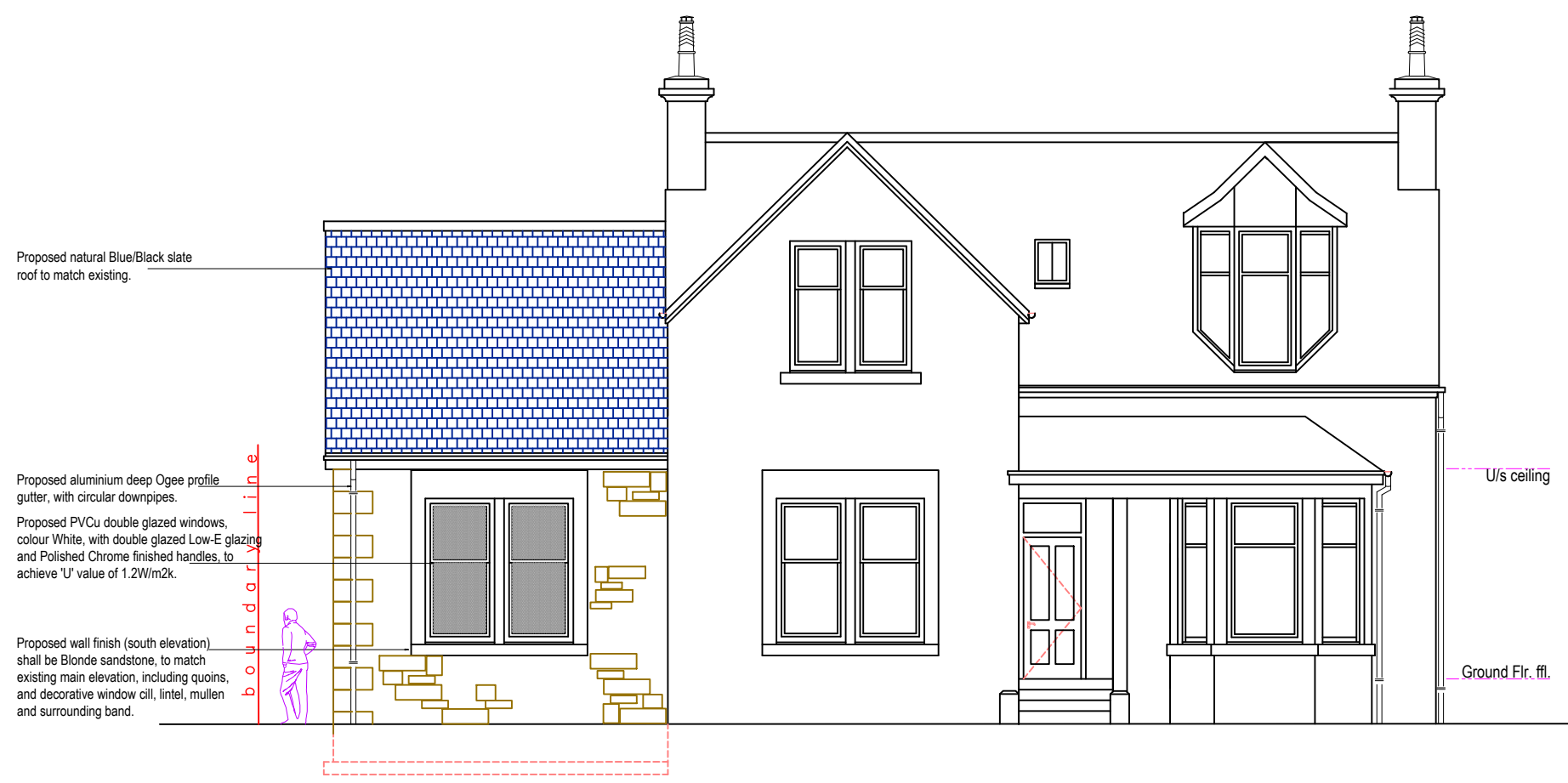
← proposed extension → Proposed South Elevation Scale 1:100