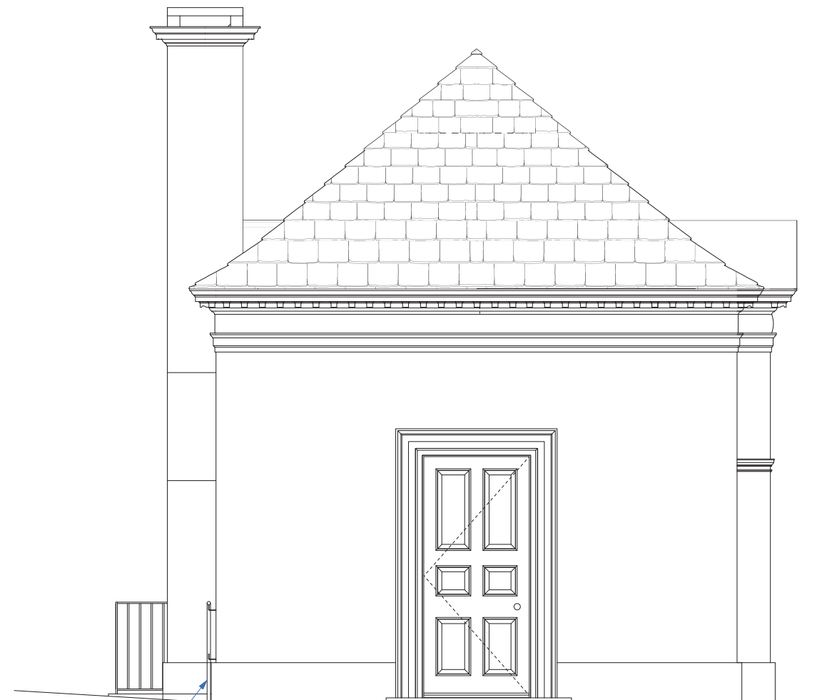
1 EAST ELEVATION 1:50 @ A3