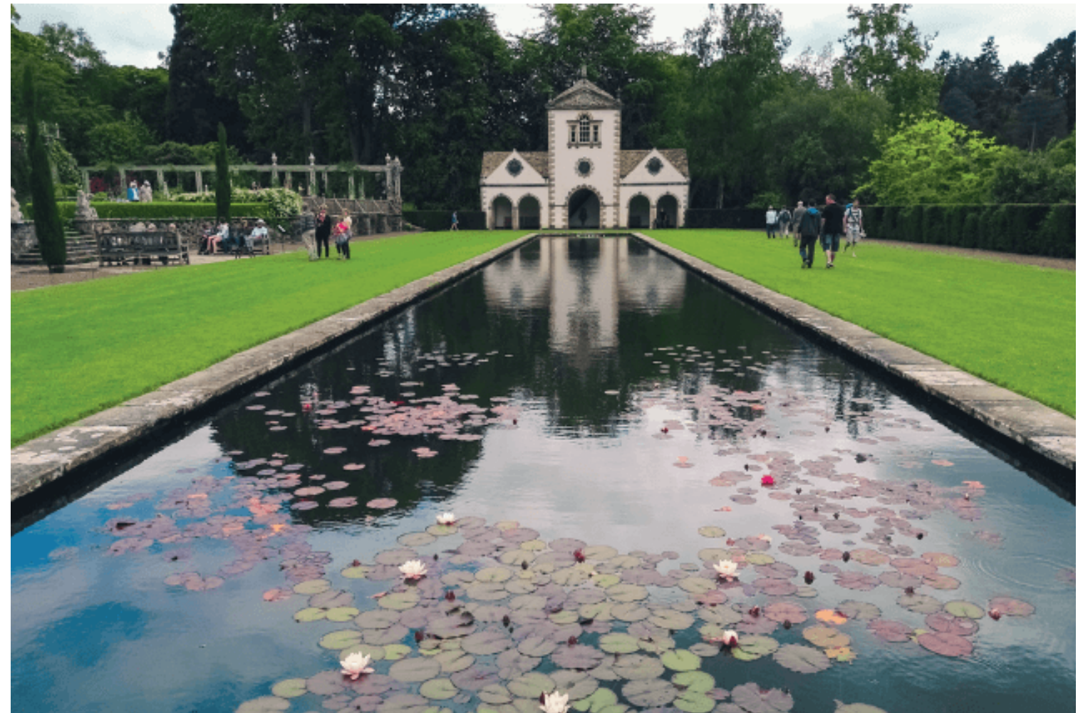
IMAGE OF THE CANAL TERRACE AT BODNANT GARDENS

Access to the proposed basement within the pavillion building will be via stairs to the rear of the building which will be compliant to building regulations.