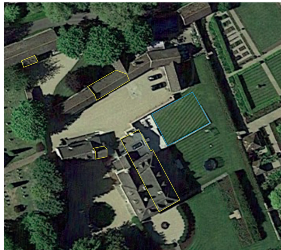
AIRIAL VIEW SHOWING PREVIOUS AREA OF MODERN INFILLED OUTDOOR POOL IN BLUE.