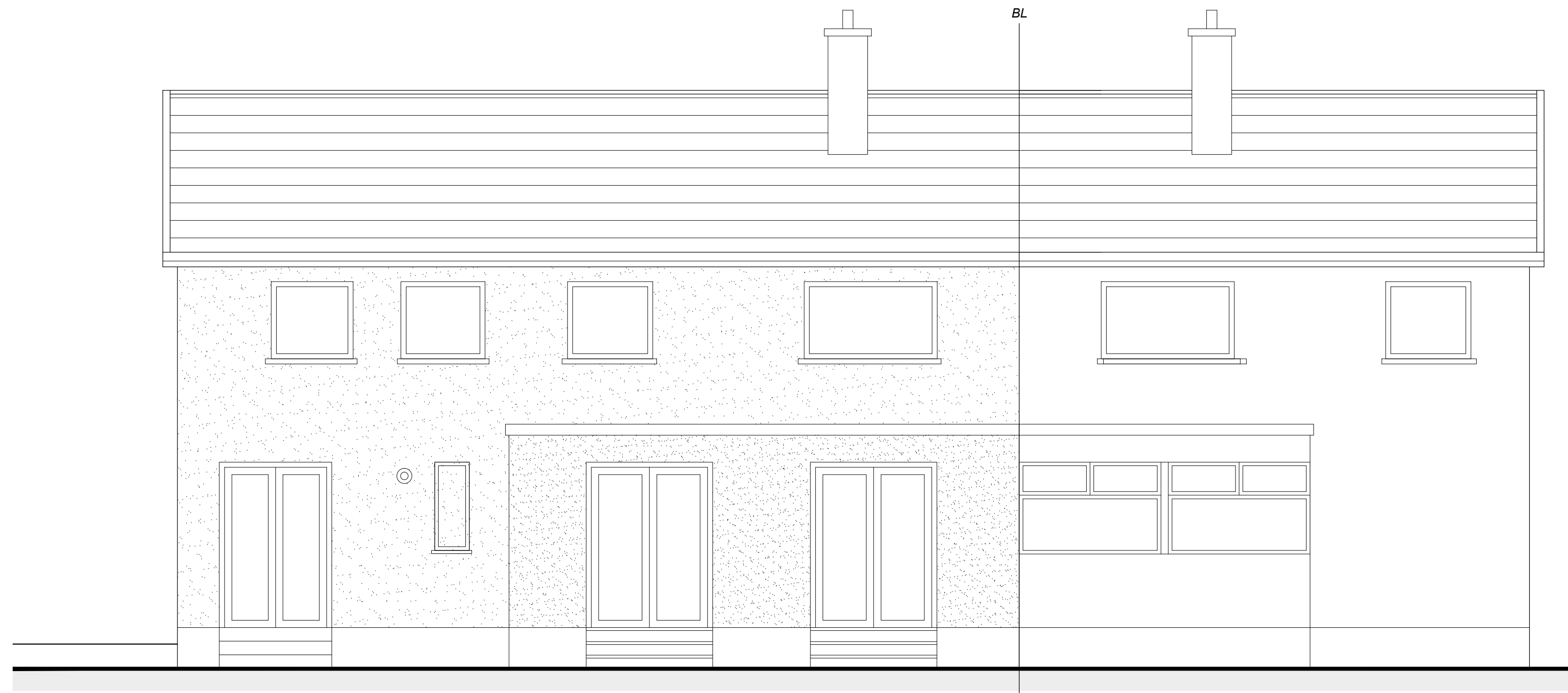
1 EXISTING REAR ELEVATION (SOUTH)