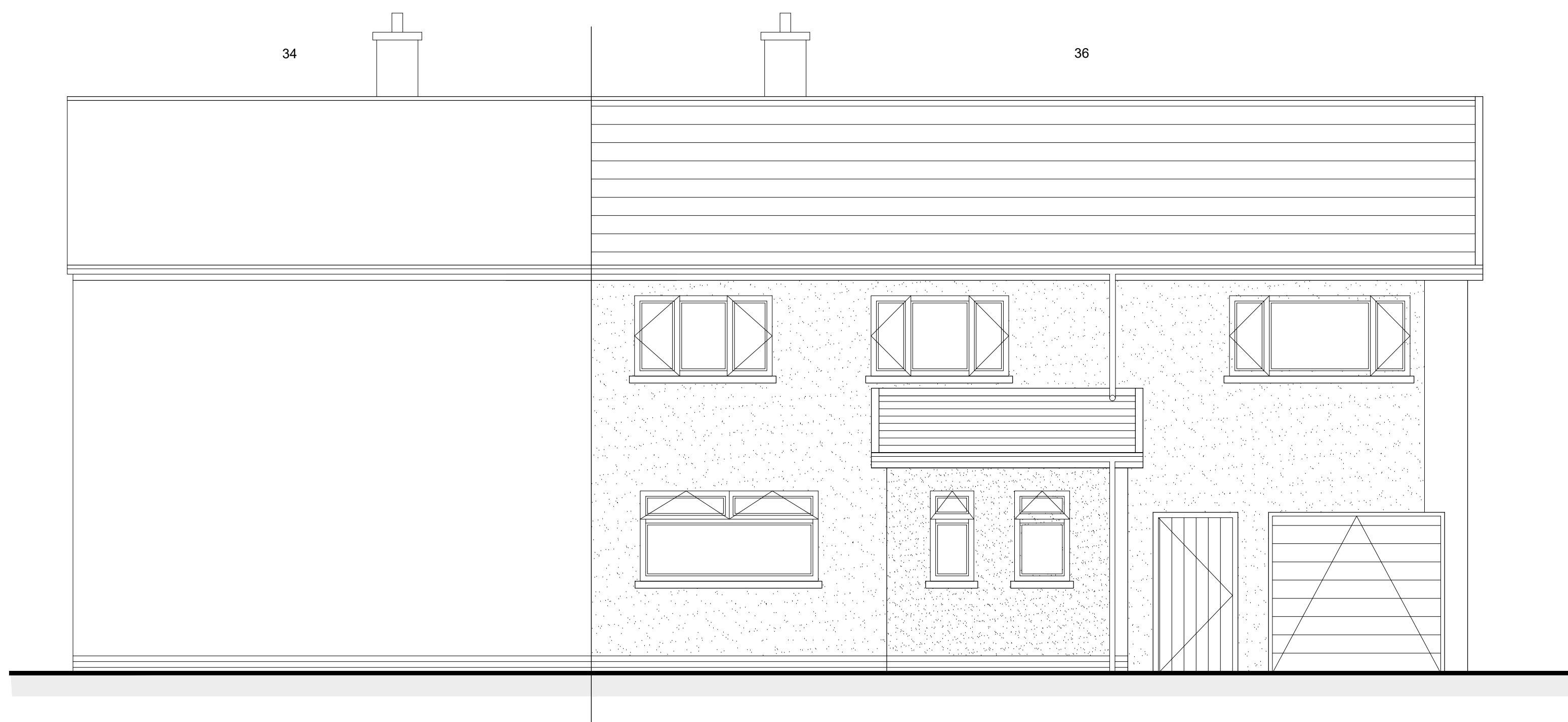
1 EXISTING FRONT ELEVATION (NORTH)